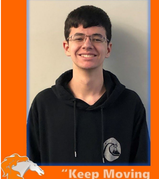
Keep Moving Forward!"