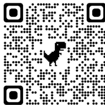
Annual Title 1 Meeting Survey