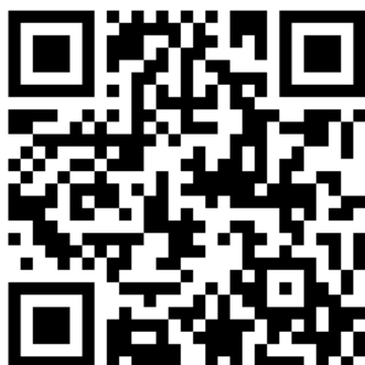
Annual Meeting Video Link