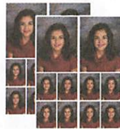
4-4x5's / 16 Wallets