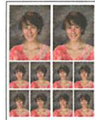
2-4x5s / 8 Wallets