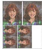
2-4x5s / 4-2x3s