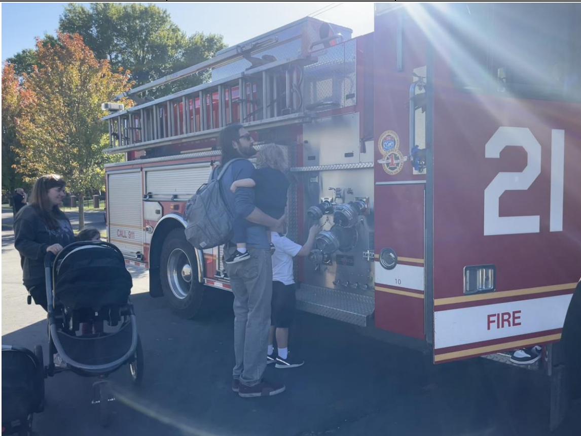
Children and families explore the firetruck.