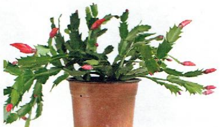
Red Comes with Foil Pot Cover