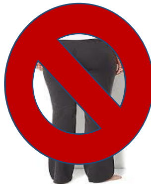
NOT OK for Davis Dress Code