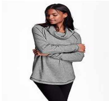
OK for Davis Dress Code

Yoga pants and leggings are allowed only with a longer shirt/sweater/top to cover. The following information has been shared with students and we appreciate your help communicating this to your children.