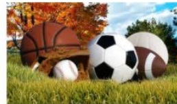
Pictures of Girls Soccer Team vs Elkton

Due to COVID restrictions, only parents and/or guardians and siblings who live in the household may attend students' games. Thank you for your cooperation. Those who want to watch the games from home can watch on nfhsnetwork.com . Go, Eagles!