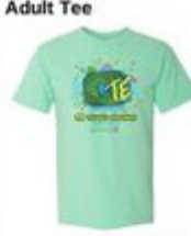
Comfort Colors GTE 40th Anniversary Adult Tee