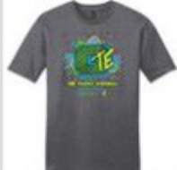
District GTE 40th Anniversary Adult Tee