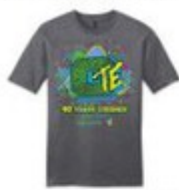
District GTE 40th Anniversary Youth Tee

Online Store Deadline: Monday May 2nd, 2022 (10:00am CDT)