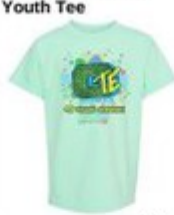
Comfort Colors GTE 40th Anniversary Youth Tee