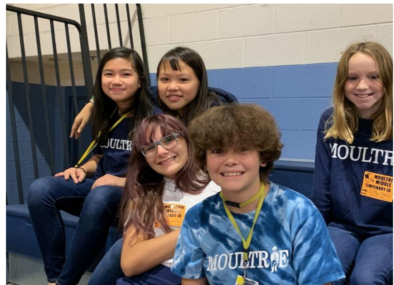
Congrats, All-County Honors Chorus 2020 (above)!