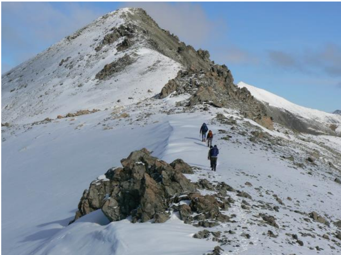
Approaching Point 1884