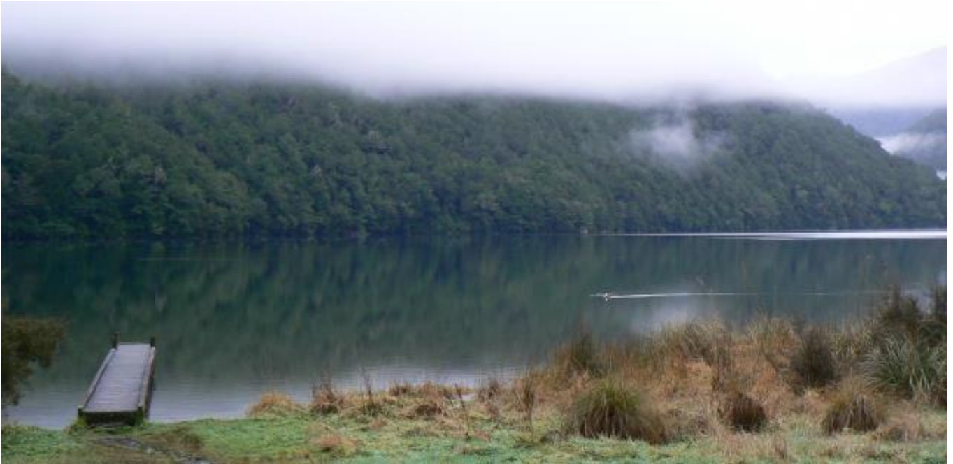
The view from Manson Nicholls Memorial Hut

When the youngsters arrived we made them responsible for the fire, and walked to the end of the lake where we were able to look back to see the hut 1¾ km away.