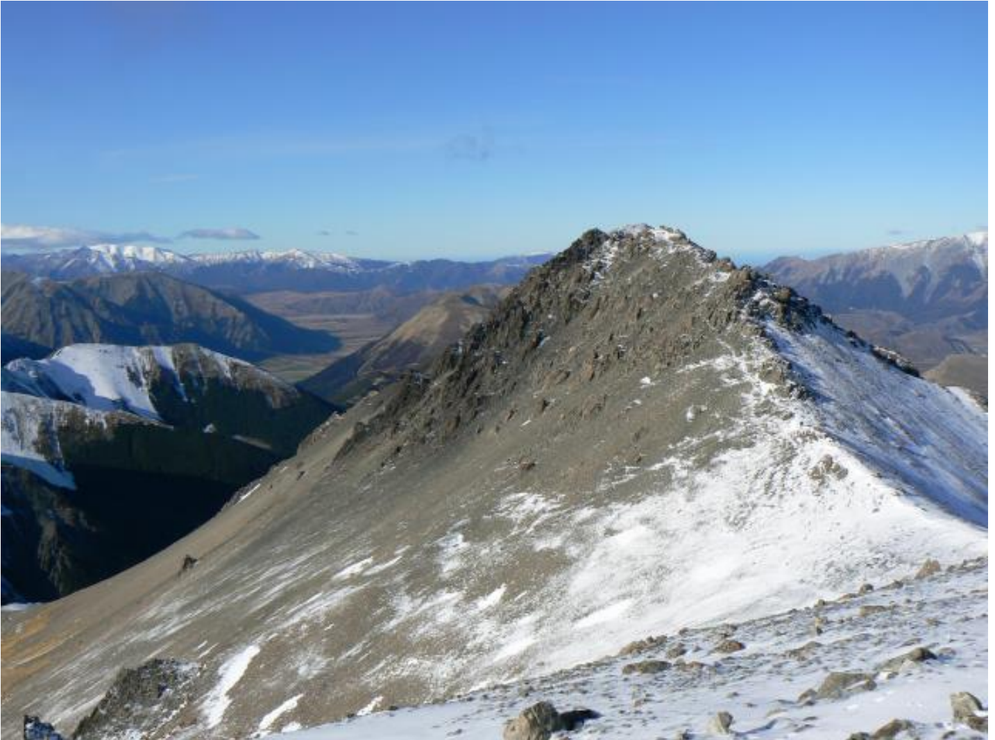
Mt Wall with the upper part of the super-scree

Peter Umbers, Darcy Mawson, Yvette So, Merv Meredith and me, Kerry Moore parked at the locked gate on the Broken River Ski Road and walked up to the field on a crisp frosty morning. On patches of snow we headed NW to gain the main ridge of the Craigieburn Range. When four of us caught up to Merv we stopped for lunch. The 2½km travel along the ridge was easy at first with a choice of snow or rock but nearer Mt Wall we were finding our way around craggy sections. Yvette and Darcy recalled exiting off 1874m Mt Wall before on its SW side then swinging east but we chose a snow-free direct easterly route for a marvelous extended scree run of 800m to Broken River. A 20 minute walk on the road got us back to the car and home to Chch with a little daylight to spare. 🏔️ KM