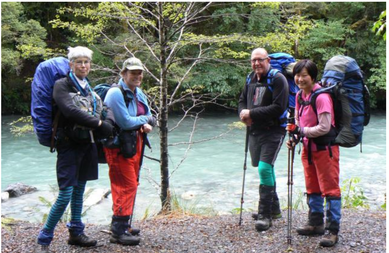
The troupe by the Alfred River