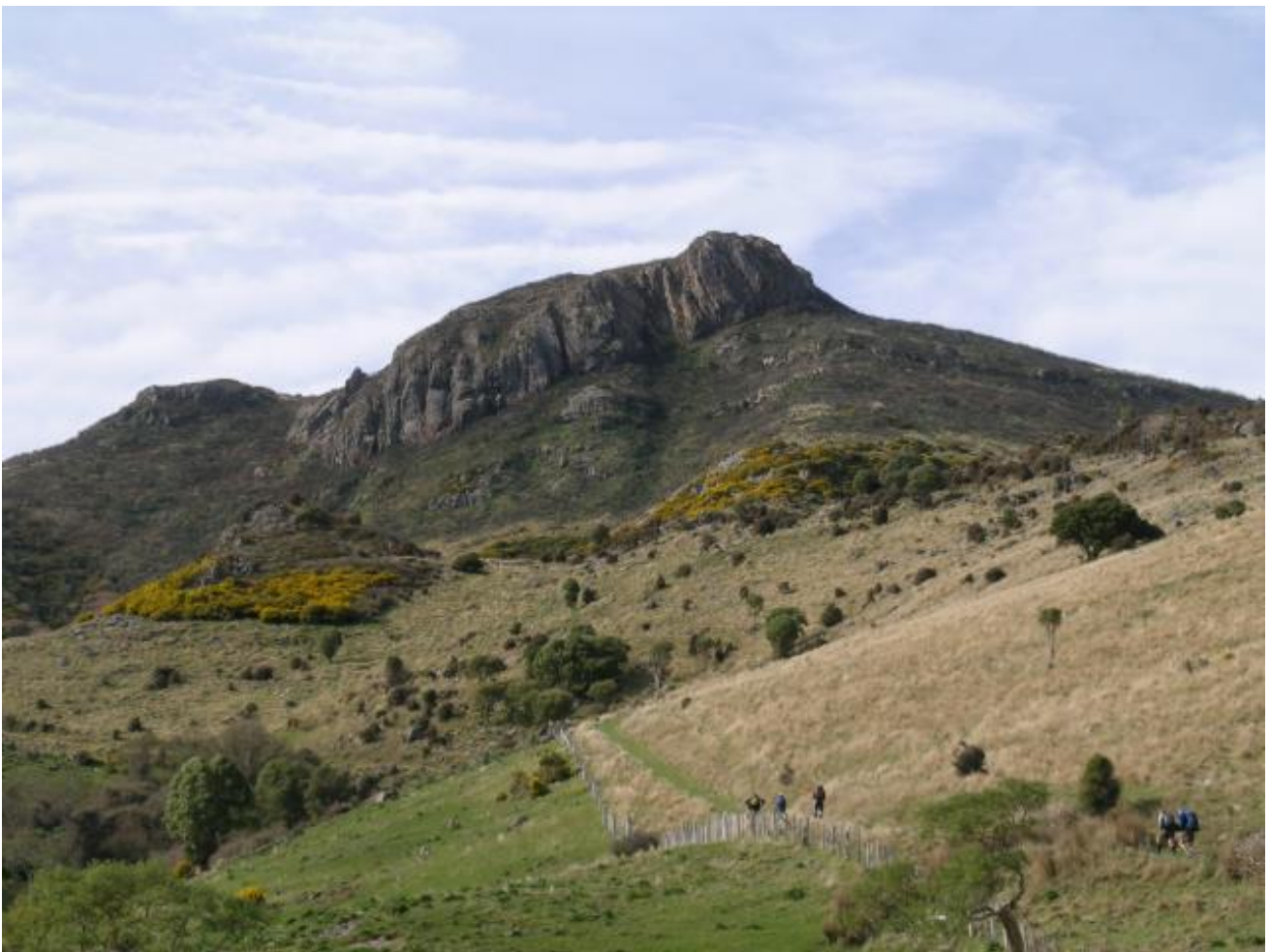
Stony Bay Peak