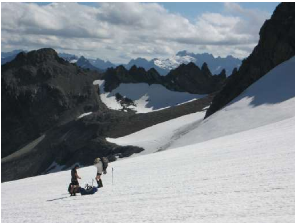
On the glacier with Mt Huxley in the distance

slips on the true right of the valley. The animal tracks were very helpful in showing us the way down to the Dobson flats.