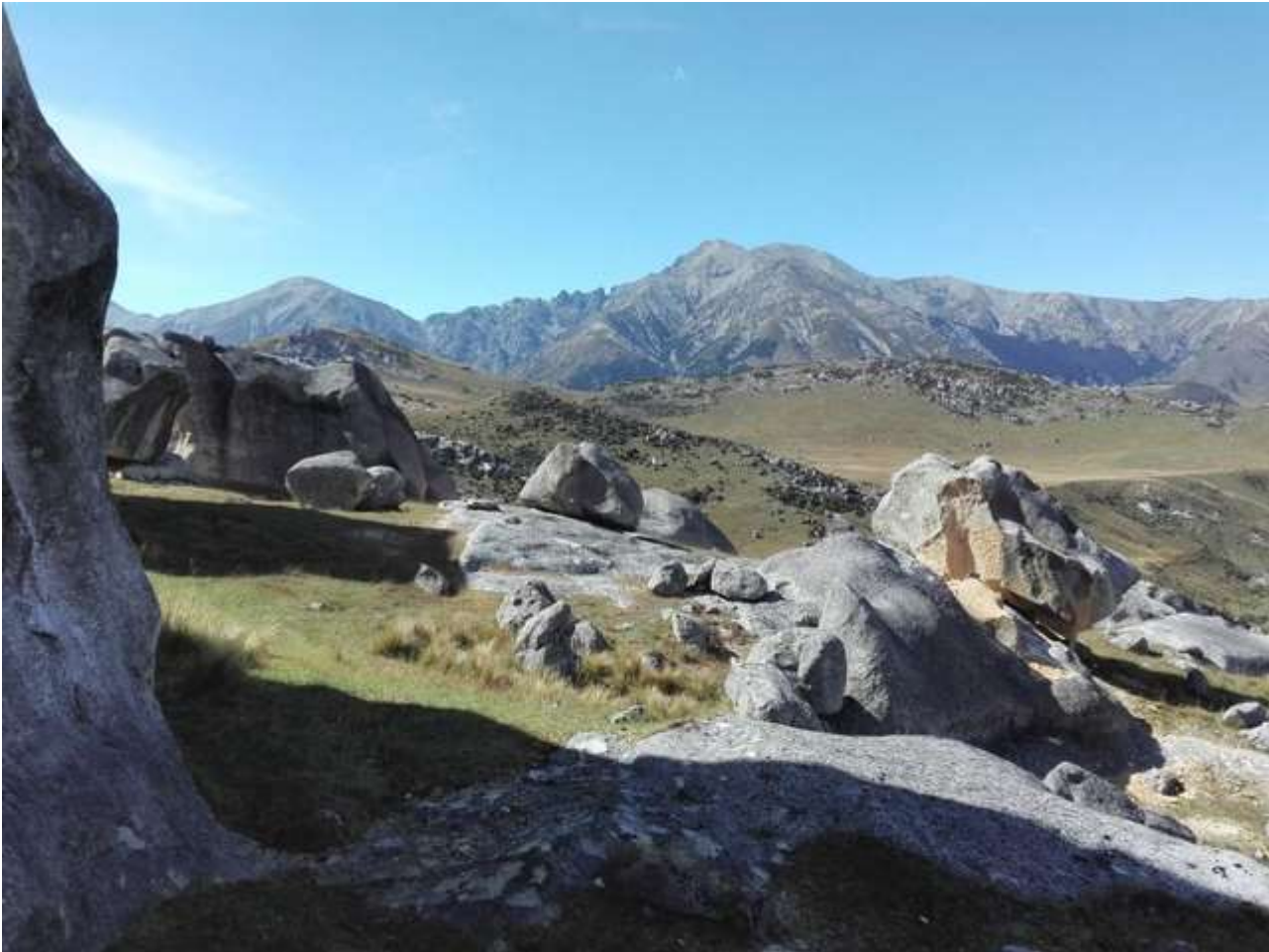
The Torlesse Gap and Castle Hill seen from Gorge Hill