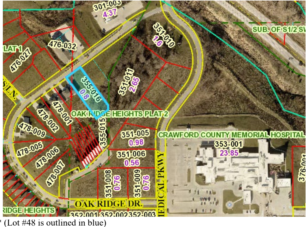
*** (Lot #48 is outlined in blue)