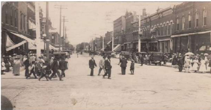
Downtown Maquoketa, 1914

Maquoketa was established as the county seat of Jackson County in 1873. Prior to that, the county seat was located in Andrew. In the early days of the city, growth was spurred by the extension of railroads to Maquoketa in 1873.