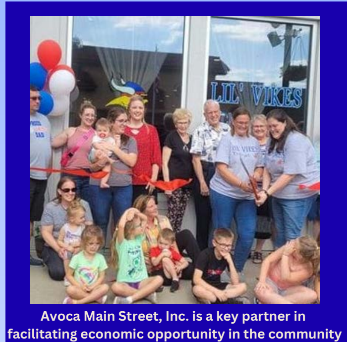
Avoca Main Street, Inc. is a key partner in facilitating economic opportunity in the community

Multiple events, such as 4 th of July, Farmers Markets, Longest Table, Spooktacular, Holidays on Main, etc. attract visitors and residents and contributes to the vibrancy of the community.