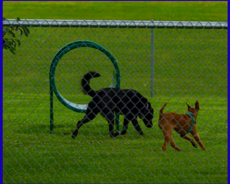
Avoca Dog Park