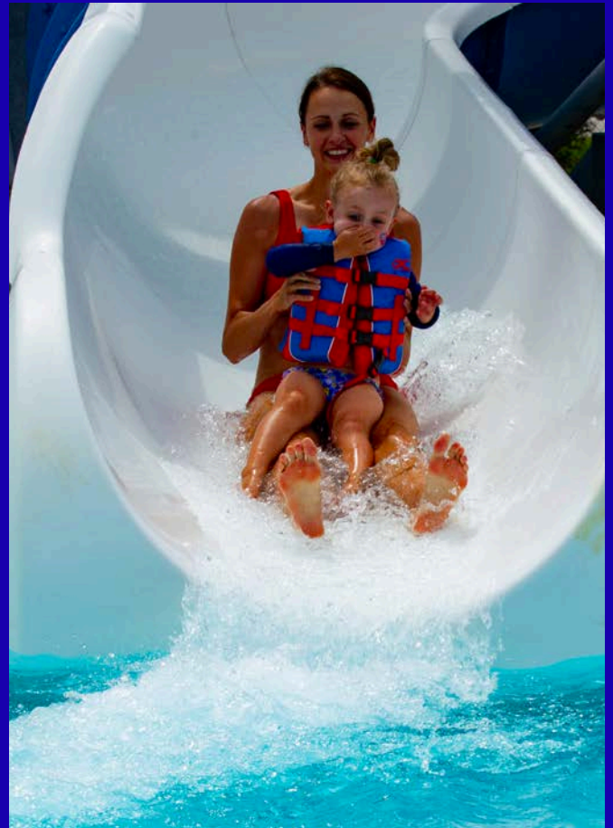
The Avoca Aquatic Center attracts more than 50,000 users annually.

The next City Administrator will be an energetic and confident leader who can communicate effectively and provide strong direction for strategic actions to achieve the community's vision. The City Administrator will become involved in the community and promote an atmosphere of quality constituent service and collaboration.