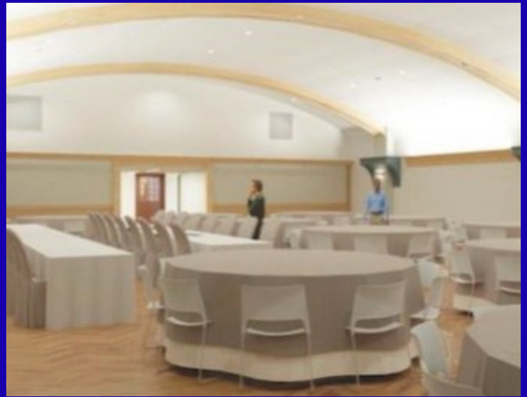
Interior renderings of the Avoca Veterans Community Center

Other areas of focus for the upcoming City Administrator include evaluating water challenges; updating water meters; collaborating with the Department of Transportation on Highway 59 improvements; supporting daycare operations; and developing and implementing plans for a City Hall expansion, among others.