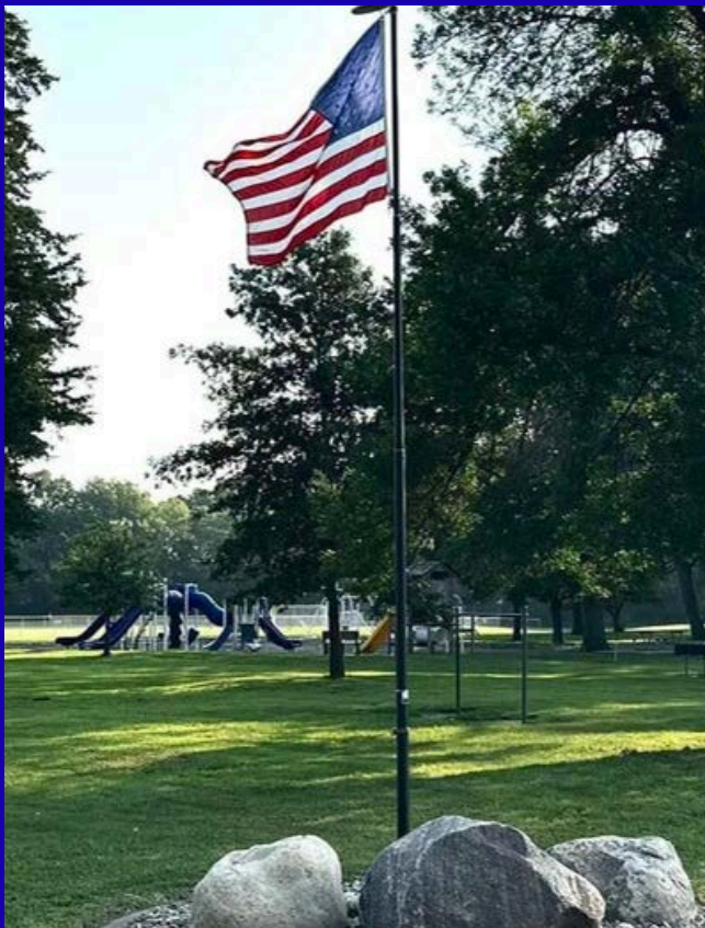
Avoca Parks offer great recreational opportunities throughout the year (above), including a 9-hole golf course (to the right)

Application deadline: November 25, 2025, 4:30 PM Semifinalists notified: December 2, 2025 Zoom interviews: December 4, 2025 Finalist interviews: December 19 & 20, 2025 Employment Agreement approval: December 22, 2025 Start of employment: 30-45 days after approval