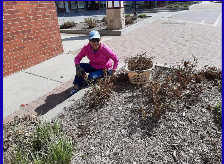
Avoca benefits from great volunteers! Keep Avoca Beautiful. Volunteers help with flower beds.