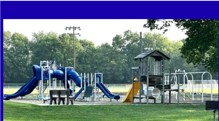
Play Structures in Edgington Memorial Park

The City is also home to the Sweet Vale of Avoca Museum. The Newtown-Avoca Historical Society has a goal of preserving for future generations. The Historical Society is comprised of s and meets monthly on the first Tuesday of the month.