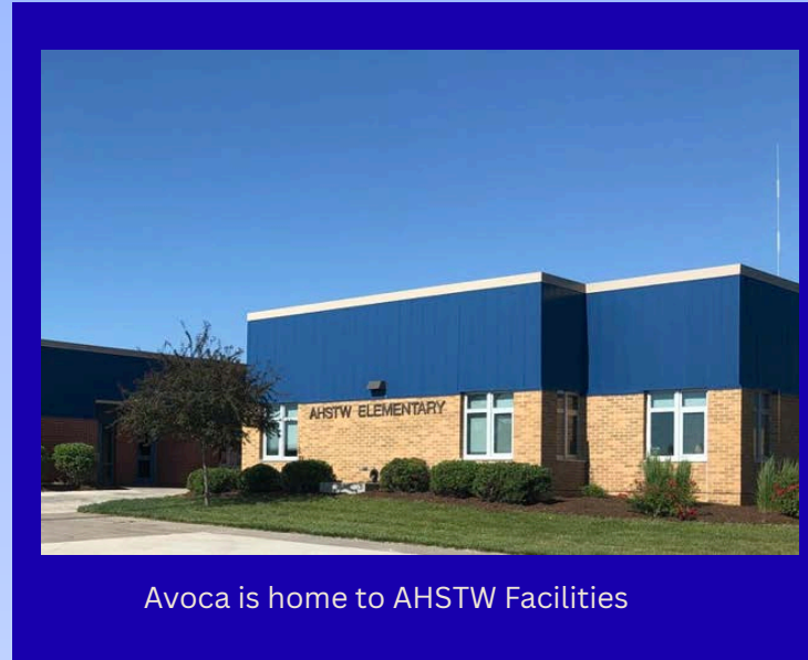
Avoca is home to AHSTW Facilities

Opportunities for further education in the region are found at Iowa Western Community College (Council Bluffs), University of Omaha (Omaha, NE), and Creighton University (Omaha, NE), Drake University (Des Moines) Grand View College (Des Moines), Iowa State University (Ames, IA), Simpson College (Indianola, IA), Des Moines University, and the Des Moines Area Community College. There are also private schools in the area.