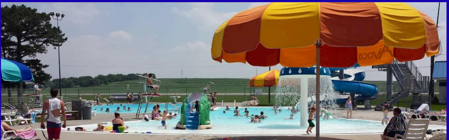
Avoca Aquatic Center

Avoca is home to three churches, with the major denominations of Catholic, Lutheran, and Presbyterian represented in the area.