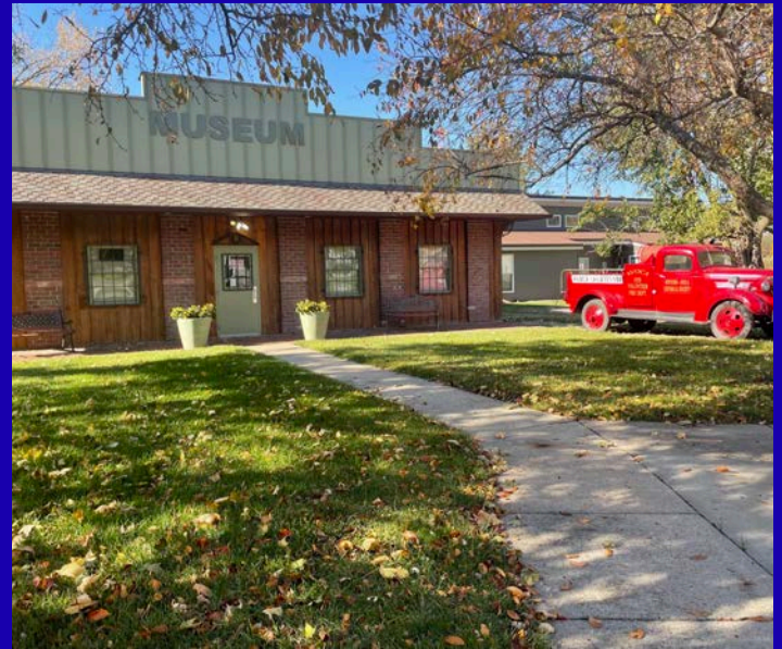
Sweet Vale Museum

Other destinations of interest include Henry Doorly Zoo and Aquarium in Omaha, Lauritzen Gardens in Omaha, Blank Park Zoo, Living History Farms, the Des Moines Science Center, the Botanical Center, etc.