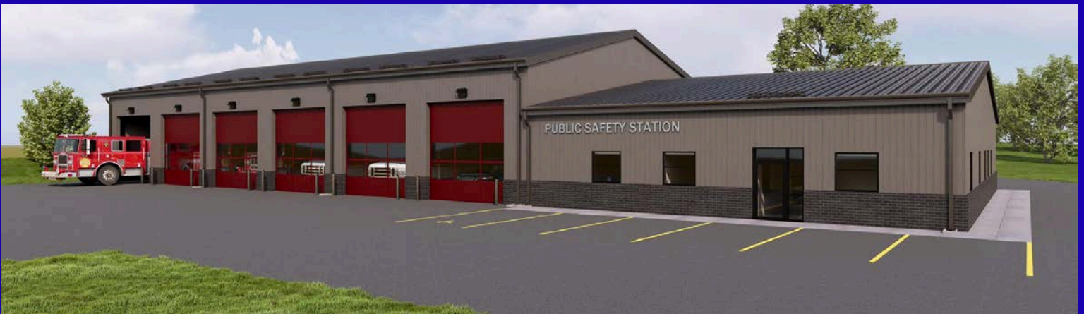
Rendering of the Avoca Fire & Rescue Station