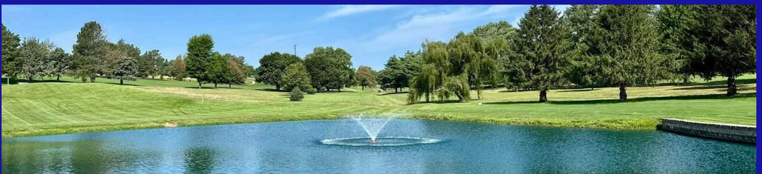
Avoca has beautiful greenspace amenities

Avoca is a Council/Mayor form of government with a City Administrator. The City is governed by a Mayor elected to two-year terms and a five-member City Council elected to four-year terms. The Avoca City Council meets regularly on the third Tuesday of every month at 5:30 p.m. The Mayor and Council are assisted by citizen boards and commissions including Culture and Recreation, Planning and Zoning Commission, Board of Adjustment, Utility Board, Avoca Veterans Community Center Commission, Avoca Betterment Association, and the Library Board. The City employs a full-time staff of 10. The total budget is $11,686,975 million, excluding transfers, with a levy rate of $14.30559. The City police force consists of partial full-time coverage augmented with support from the Pottawattamie County Sheriff. Fire protection services are provided by a 29 member volunteer department. The City operates a water utility and a wastewater treatment plant. The water supply is from the Regional Water Rural Water Association with the City providing water transmission and maintenance. The City also operates a stormwater utility.