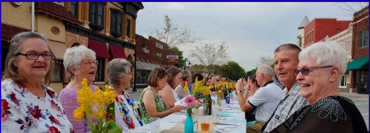
Longest Table Dining Event

Avoca is adjacent to Interstate 80, which runs from Boston, MA to San Francisco, CA and is served by State Highway 59. For train travel, Avoca is 45 minutes from Omaha and 2 hours from Osceola, IA, both with major Amtrak connections. Omaha’s Eppley Field is 50 minutes away and the Des Moines International Airport is approximately 90 minutes away, both undergoing major expansions and both offering domestic and international flights. There are also smaller general aviation airports near Avoca, such as the Harlan Municipal Airport, Ida Grove Municipal Airport, and the Dacy Airport, available for private flights and smaller aircraft.