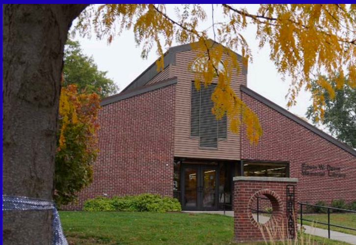
Avoca Public Library

Avoca has long been a gateway between urban and rural living, offering residents and visitors the best of both worlds. The city combines a strong sense of community with the convenience of being just 40 miles from Omaha, Nebraska, and approximately 60 miles from Des Moines, Iowa. Avoca is a small town with a big heart, offering an ideal setting for someone seeking to make a significant impact in local government. The community is tight-knit, and residents enjoy an array of local parks, recreational activities, and a strong sense of civic pride. The city's downtown area features a mix of historic buildings, local businesses, and community gathering spots, creating a welcoming environment for both residents and visitors.