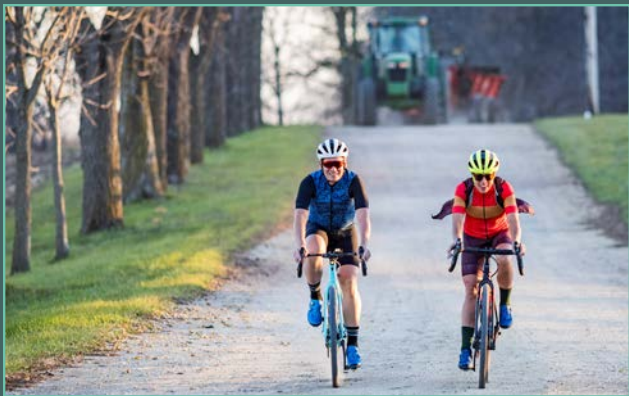
Green County’s extensive trail network—including the Badger State Trail, Cheese Country Trail, and Sugar River Trail—offers year-round opportunities for outdoor recreation. These scenic routes connect communities, support a variety of permitted activities, and provide residents and visitors with memorable ways to experience the region’s natural landscapes.