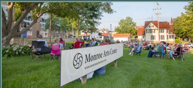
Residents have an appreciation of the arts, reflected in the vibrant Monroe Arts Center and supported by creative organizations throughout Green County. From the community-driven Theater Guild to local galleries, music programs, and festivals, the county fosters a rich cultural landscape that brings people together and celebrates artistic expression.

Established in 1837, Green County has deep roots in Wisconsin’s early settlement period and quickly became an important agricultural and cultural hub in the state’s south-central region. Early settlers, including many Swiss immigrants, brought with them traditions in cheesemaking, craftsmanship, and community festivals that continue to shape the County’s identity today. Small farming communities grew steadily throughout the nineteenth century, supported by fertile land, emerging rail connections, and a thriving dairy economy. Today, Green County’s historic churches, farmsteads, creameries, and downtown districts stand as reminders of its rich past while the County continues to embrace growth, innovation, and a strong sense of community.