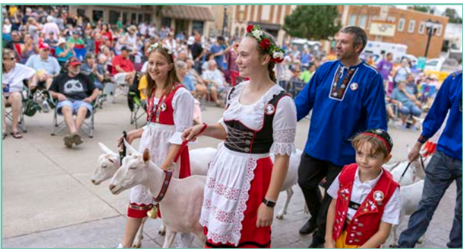
Residents celebrate the County’s Swiss heritage during Cheese Days in Monroe.

Green County offers a rich blend of natural beauty, cultural vibrancy, and community spirit. The area is widely known for its thriving food and craft-beverage scene, anchored by renowned creameries, breweries, and restaurants that celebrate the County’s Swiss heritage and agricultural roots. Outdoor recreation is plentiful, with rolling countryside, extensive bike trails, trout streams, and parks providing year-round opportunities for hiking, cycling, snowmobiling, and community events. Together, these amenities create an exceptional quality of life that attracts residents, visitors, and businesses to this welcoming corner of Wisconsin.