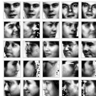
Figure 1: Examples of five faces in each orientation. First row: frontal. Second row: right half profile. Third: left half profile. Fourth: Right profile. Fifth: Left profile.

The primary dataset that is used in this study is composed of 20x20 pixel intensity images of faces. In each image, the face is in one of five orientations: frontal, right half profile, left half profile, right full profile or left full profile, as shown in Figure 1. The right/left images are mirrors of each other.