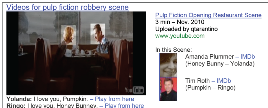
Fig. 4. Sketch of an extended Rich Snippet featuring semantically highlighted video preview (still frame or moving images), actor information, and in-video links.