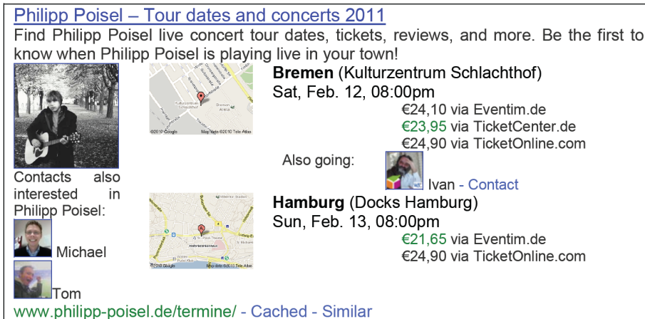
Fig. 3. Sketch of an extended Rich Snippet featuring maps previews, image preview, event and price information, including cheapest offer highlighted. In addition to that, the user's social graph is processed in order to find people interested in the same artist and to display who else plans to attend a particular event.