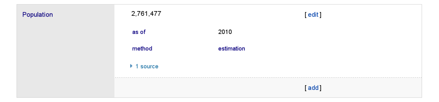
Figure 1: Screenshot of a complex statement as displayed in Wikidata

has a closely related mechanism: language links , displayed on the left of each article, connect articles in different languages. These links were created from user-edited text entries at the bottom of every article, leading to a quadratic number of links: each of the 207 articles about Rome contained a list of 206 links to all other articles about Rome—a total of 42,642 lines of text. By the end of 2012, Wikipedias in 66 languages contained more text for language links than for actual article content.