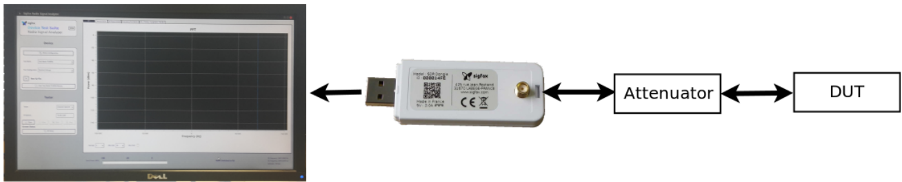
Computer with Radio_Signal_Analyser