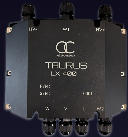
Example above is a custom 400VDC implementation