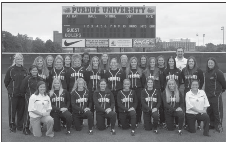
The 2007 Boilermakers set school records for runs (308), doubles (73), home runs (44), total bases (706), walks (189) and complete games (52). The team finished the season with a 33-32-1 record and posted the first postseason win in program history with a victory over Iowa in the Big Ten Tournament.