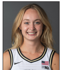
14 AVA LEARN