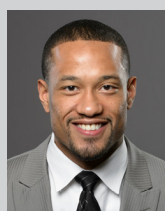
Marcus Freeman Linebackers