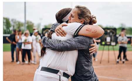
MAY 7, 2024