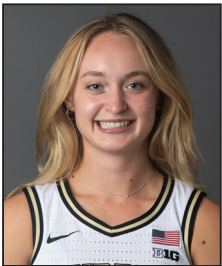
14 AVA LEARN