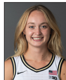
14 AVA LEARN