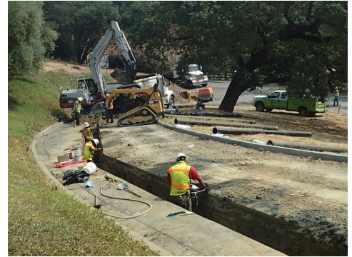
Installation of 8" ductile iron pipe along Old Snakey Road.

On July 14, 2021, the Purissima Hills Water District (PHWD) accepted as complete the Taaffe/Elena/Moody Roads Water Main Replacement Project . The project was completed on schedule and with less than $2,500 (0.06%) in change orders (excluding work added by the District) on a nearly $4,000,000 budget. The project started in May, 2020, and consisted of installing approximately 10,165 linear feet of new ductile-iron pipe to replace aging or undersized pipe in the areas along Taaffe Road, Elena Road, Moody Road, Vista Del Valle Court, and Old Snakey Road. Fire protection was also increased in those areas with the installation of new fire hydrants.