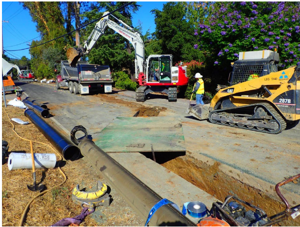
Installation of 12" ductile iron pipe along Taaffe Road.