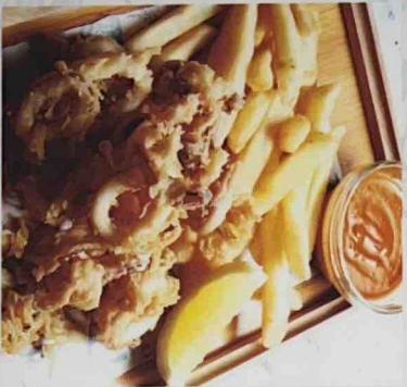
CALAMARI AND CHIPS $16.8 Calamari with Fries HYOGO OYSTERS $24 6 pcs of Hyogo Oysters with Lemon