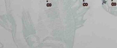
GRILLED STRIPILOIN $33.8 Grilled US Prime Striploin (200g) with Truffle Salt, Choice of Salad or Fries

All food and beverage consumed on premise are subjected to 10% service charge.