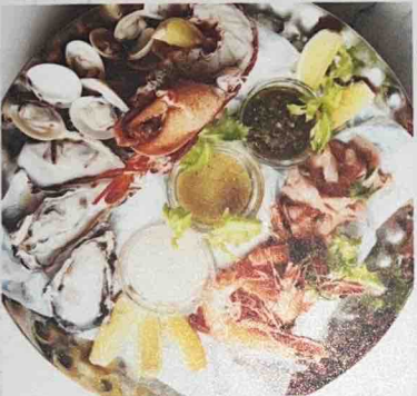
SEAFOOD OYSTERS $78 Half Boston Lobster, 3 Hyogo Oysters, 4 Tiger Prawns, Ora King Salmon Sashimi, Shortneck Clams, Thai Chili Sauce & Seafood Sauce