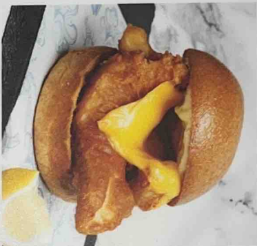
FISH BURGER $18.8 Beer Battered Haddock, Brioche Bun, Cheese, Homemade Tartar Sauce, Fries