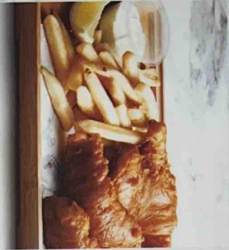
FISH AND CHIPS $23.8 Beer Battered Haddock, Homemade Tartar Sauce, Fries