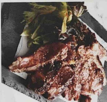
GRILLED RIBEYE $38.8 Grilled US Prime Ribeye (200g) with Truffle Salt, Choice of Salad or Fries