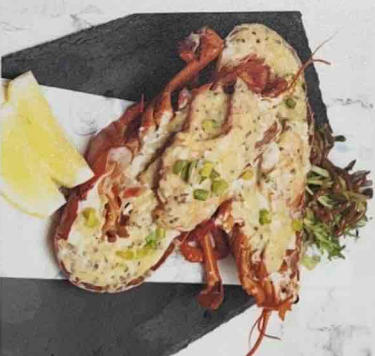
GRILLED LOBSTER $58.8 500g Live Boston Lobster, Umami Butter Sauce, Choice of Salad or Fries 600g Live Boston Lobster, Umami Butter Sauce, Choice of Salad or Fries