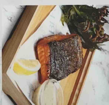
GRILLED SALMON $28.8 Aged Ora King Salmon fillet(150g), Umami Butter Sauce, Choice of Salad or Fries