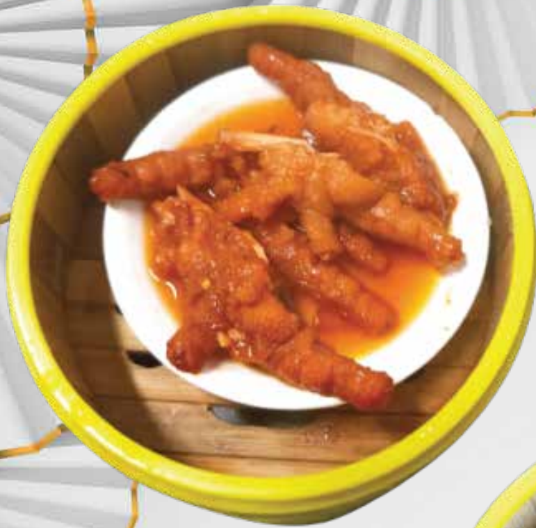
A09 凤爪 CHICKEN FEET $5.00