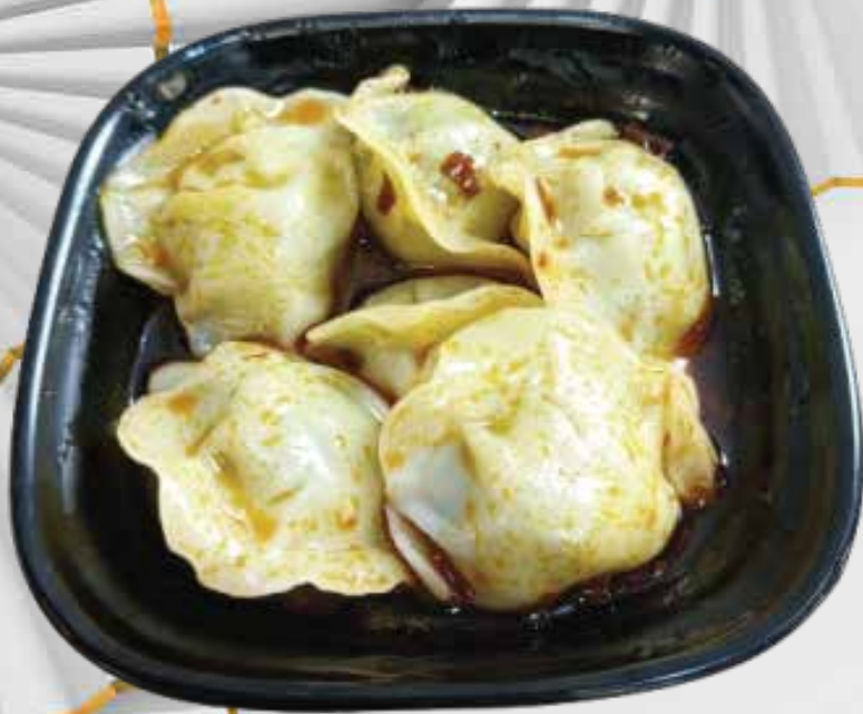
F09 红油抄手 DUMPLING IN CHILLI OIL (6 PCS) $7.00