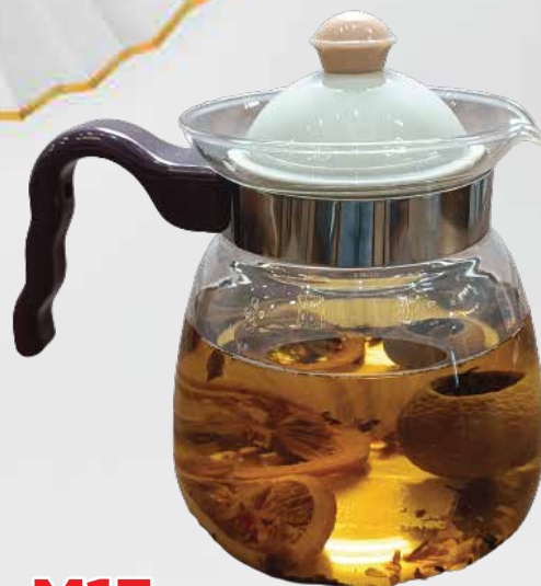
M13 小青柑 $8.00 PREMIUM TEA (1 POT)