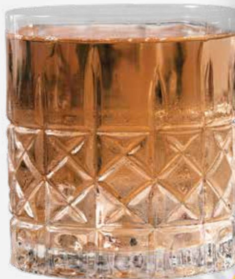
M05 香片 $2.50 XIANG PIAN (1 GLASS)