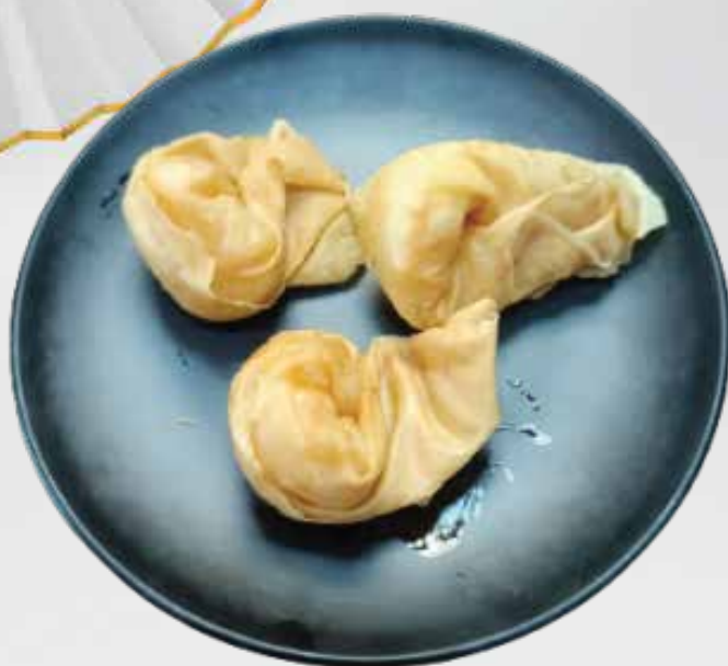
B08 鲜虾凤尾 SHRIMP AND ANCHOVIES $4.80