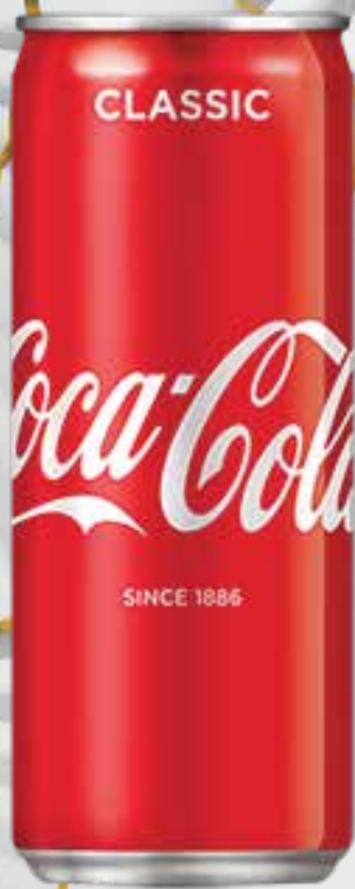
M01 可乐 COKE $2.50