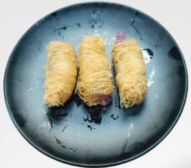
H08 金丝香芋酥 STREDDED TARO BALL $5.50