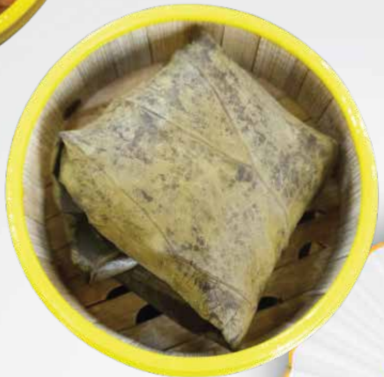
A10 荷叶糯米鸡 LOTUS LEAF RICE $5.50