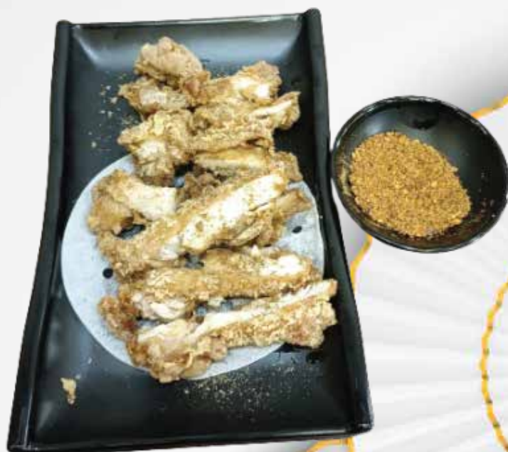
B10 椒盐鸡排 CHICKEN CHOP $7.50