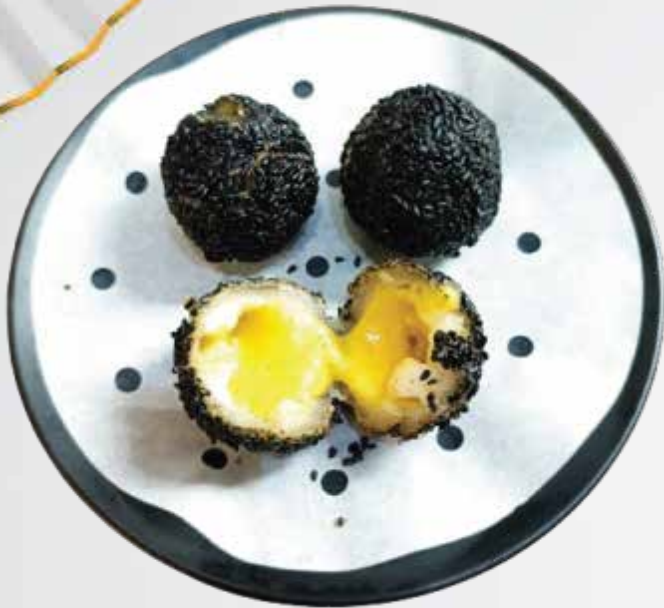
H09 黑芝麻流沙煎堆 CUSTARD SESAME BALL $4.80