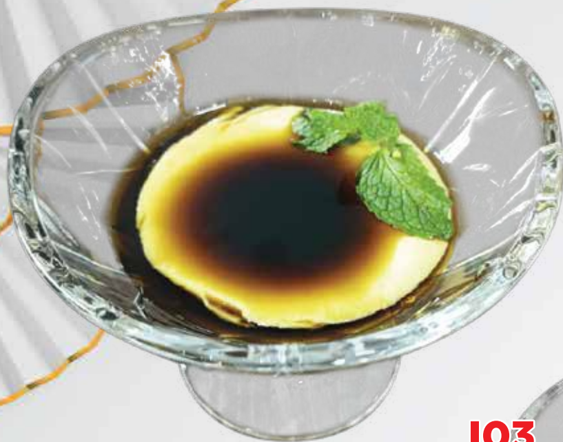
I02 焦糖蛋奶布丁 CARAMEL EGG PUDDING $3.80