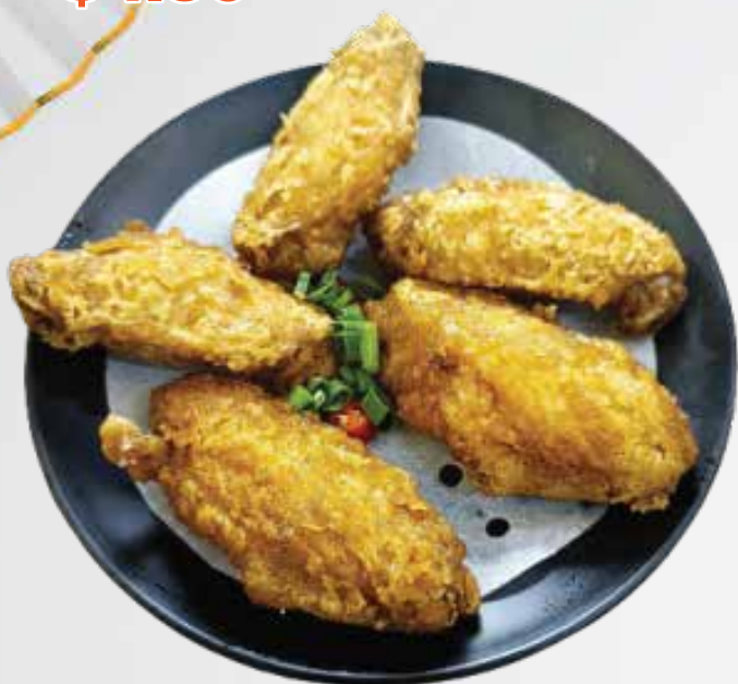
B09 香脆鸡中翅 CRISPY CHICKEN WING $7.50