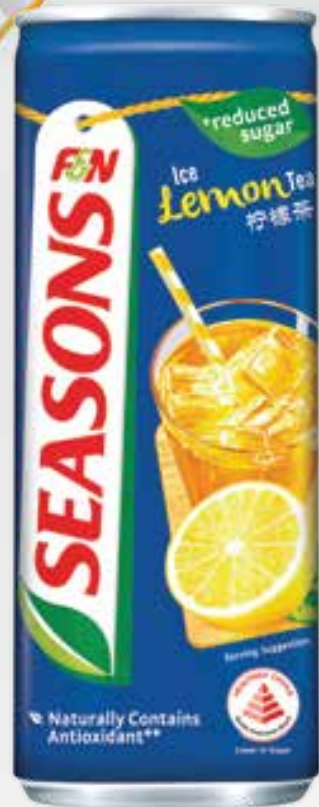
M03 冰镇柠檬茶 ICE LEMON TEA $2.50