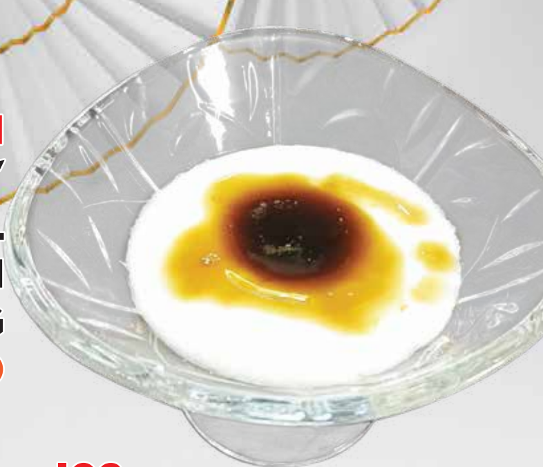
I01 焦糖双皮奶布丁 CARAMEL DOUBLE SKIN MILK PUDDING $3.80