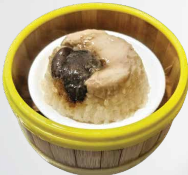
A11 糯米鸡 GLUTINOUS RICE WITH CHICKEN $4.20