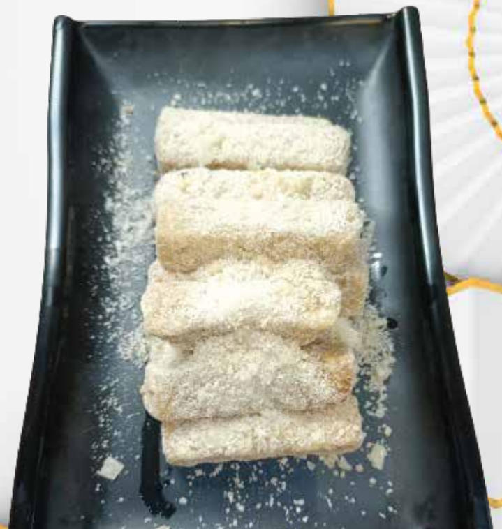
H10 粉砂芋头 TARO IN SUGAR FLAKE (8 PCS) $4.80