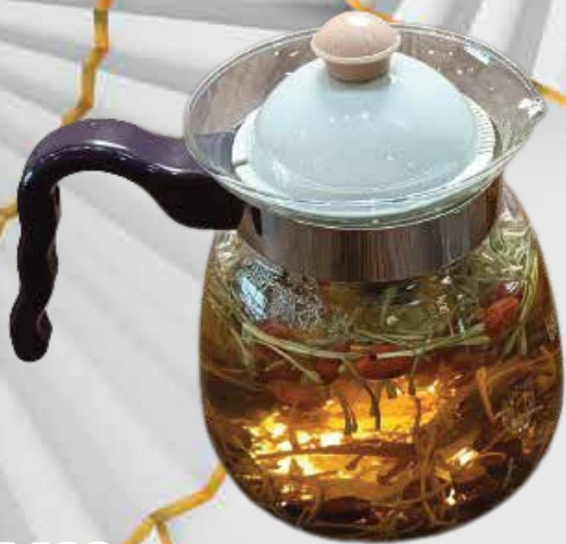
M12 养身花茶 $8.00 ASSORTED TEA (1 POT)