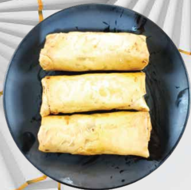
B07 香脆春卷 SPRING ROLL $4.80