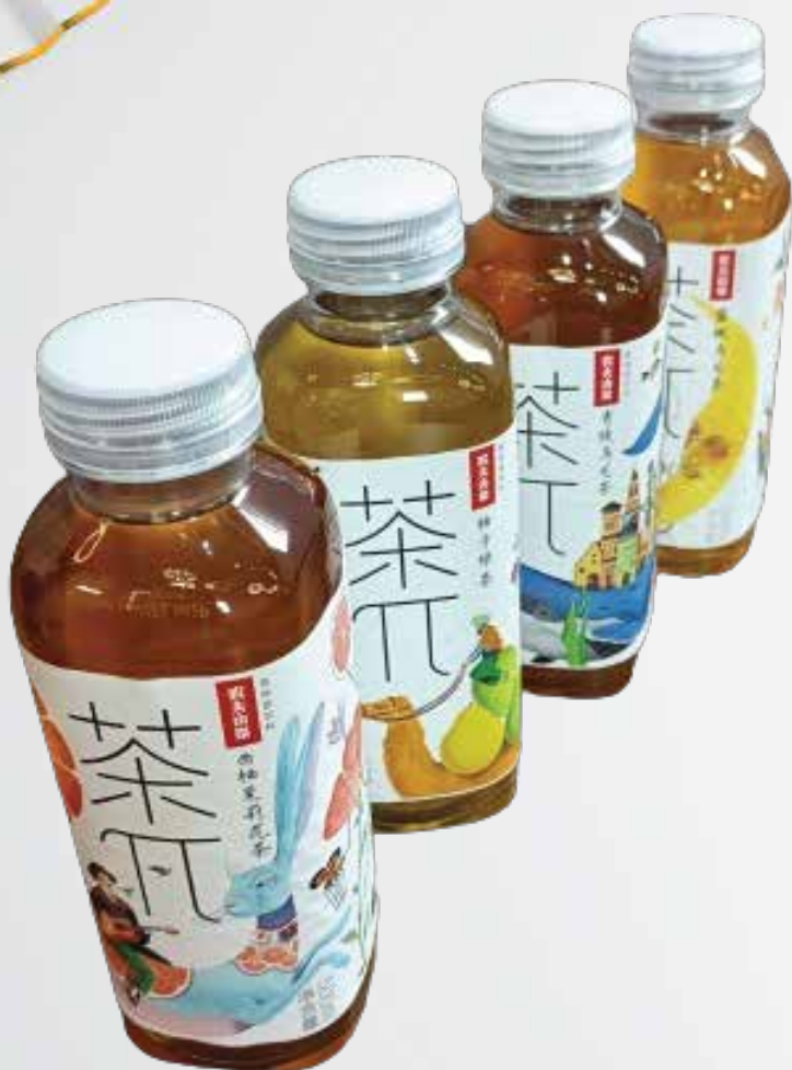
M15 蜜桃乌龙茶 $3.50 PEACH OOLONG TEA