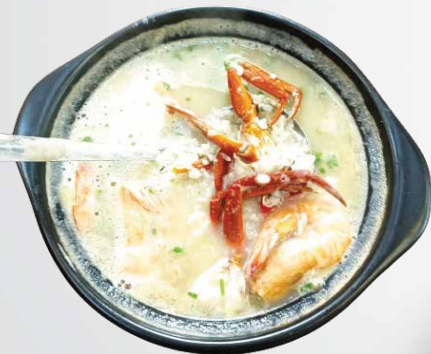
F06 海鲜砂锅粥 SEAFOOD PORRIDGE (4PAX) $48.00