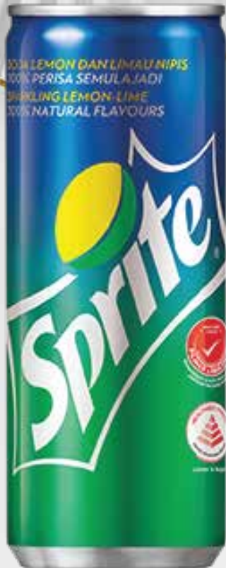
M02 雪碧 SPRITE $2.50