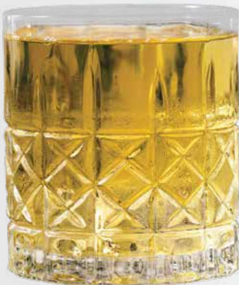
M04 绿茶 $2.50 GREEN TEA (1 GLASS)