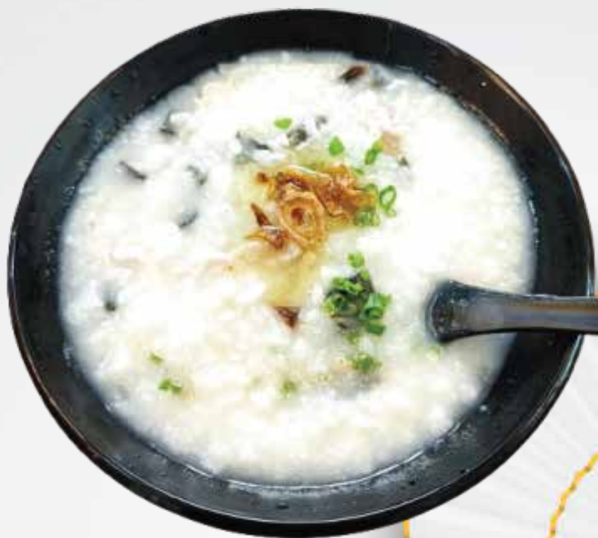
F05 皮蛋瘦肉粥 CENTURY EGG PORK PORRIDGE $6.50