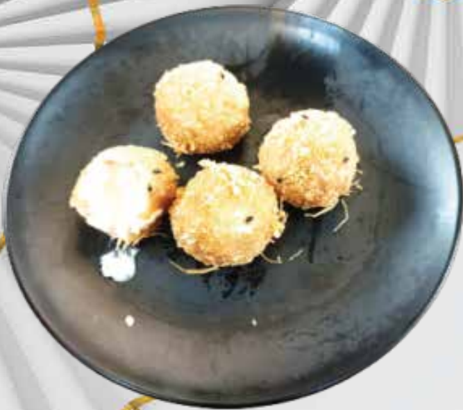
H07 椰心流心球 $4.80 COCONUT LAVA BALL