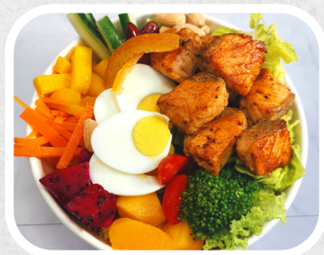
Smk paprika salmon $9.90 Glazed miso salmon $10.90