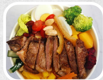
Striploin beef $14.90