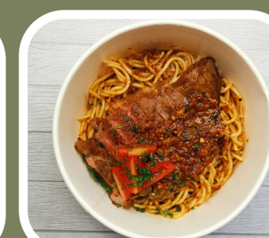
Spicy garlic beef striploin aglio olio $15.90