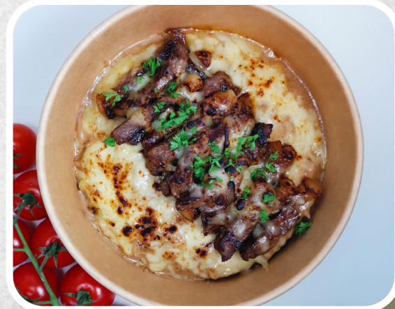
Cheesy beef striploin $18.90

Choose your sauce: creamy pepper creamy mushroom creamy tomato