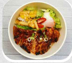
BBQ Korean chicken