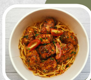
Spicy garlic salmon aglio olio $13.90