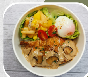
Creamy mushroom/ pepper chicken