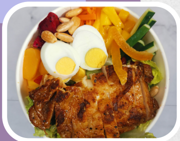
Roasted chicken $9.90 Korean BBQ $10.90 Teriyaki chicken $10.90