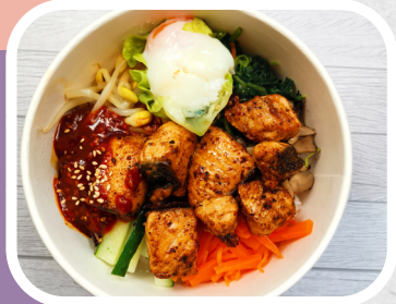
Smoked paprika salmon