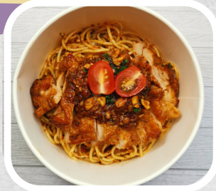
Spicy garlic chicken aglio olio $10.90