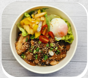
Glazed teriyaki chicken