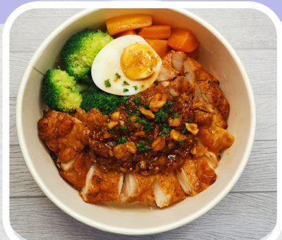
Spicy garlic chicken