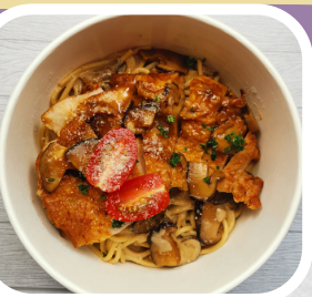
Creamy pepper/mushroom chicken $10.90