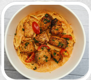
Creamy tomato salmon $14.90