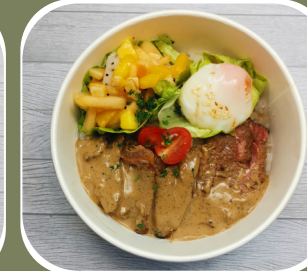
Creamy mushroom/ pepper beef