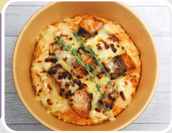
Cheesy salmon $16.90