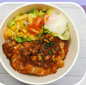
Spicy garlic chicken