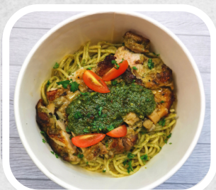
Coriander chicken aglio olio $10.90