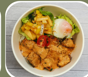
Creamy tomato salmon