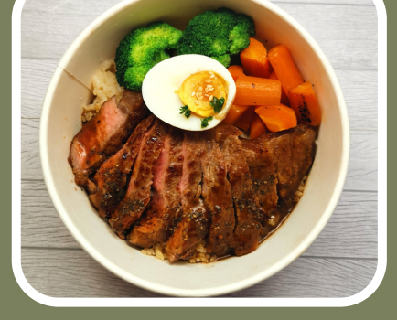
Pepper/mushroom beef striploin