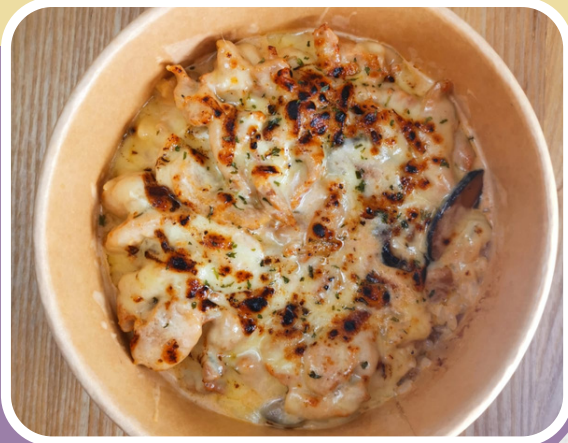
Cheesy chicken $14.9)