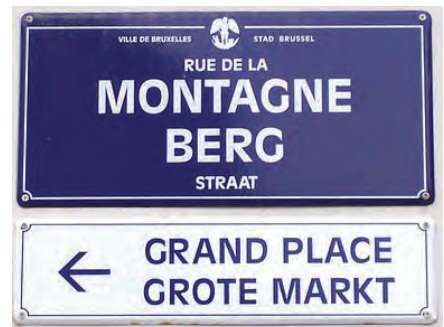
The photograph here is of a street address in Belgium. You will notice that place names and directions in two languages – French and Dutch.