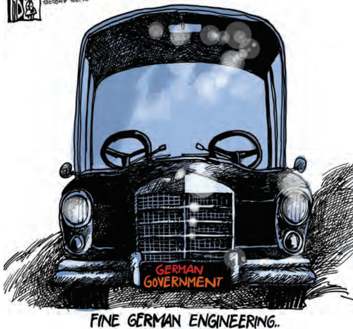
© Tab - The Calgary Sun, Cagle Cartoons Inc.

The cartoon at the left refers to the problems of running the Germany's grand coalition government that includes the two major parties of the country, namely the Christian Democratic Union and the Social Democratic Party. The two parties are historically rivals to each other. They had to form a coalition government because neither of them got clear majority of seats on their own in the 2005 elections. They take divergent positions on several policy matters, but still jointly run the government. For details about the German Parliament, visit https://www.bundestag.de/en