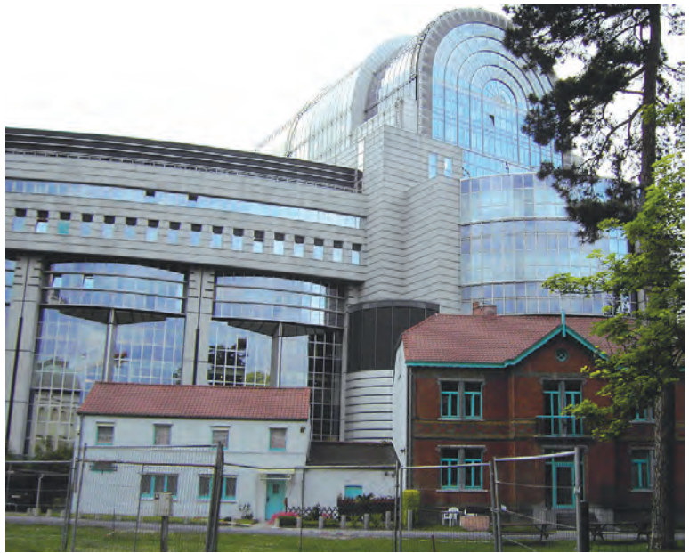
European Parliament in Brussels, Belgium

You might find the Belgian model very complicated. It indeed is very complicated, even for people living in Belgium. But these arrangements have worked well so far. They helped to avoid civic strife between the two major communities and a possible division of the country on linguistic lines. When many countries of Europe came together to form the European