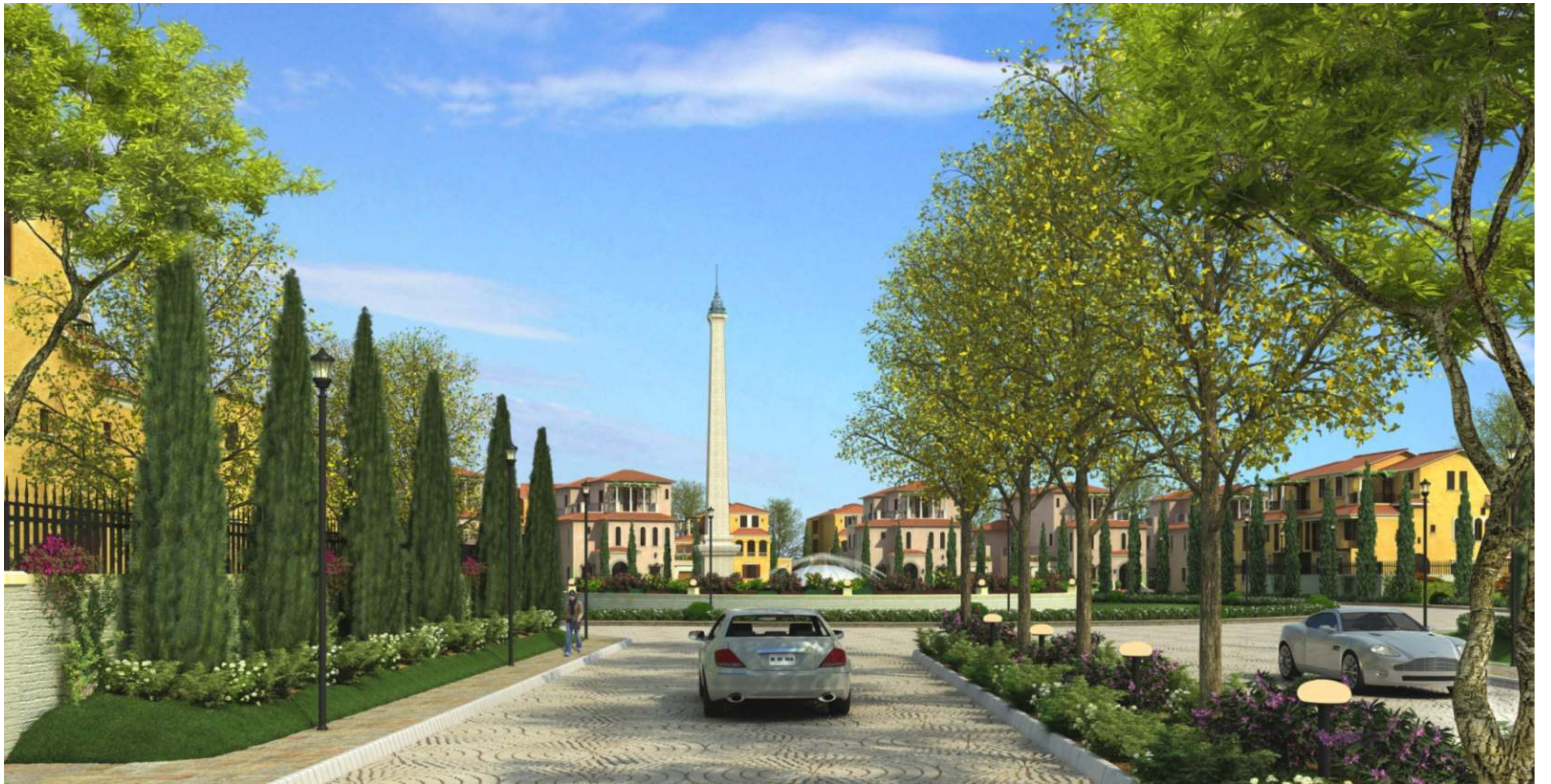
Streetscape at Gurgaon 99