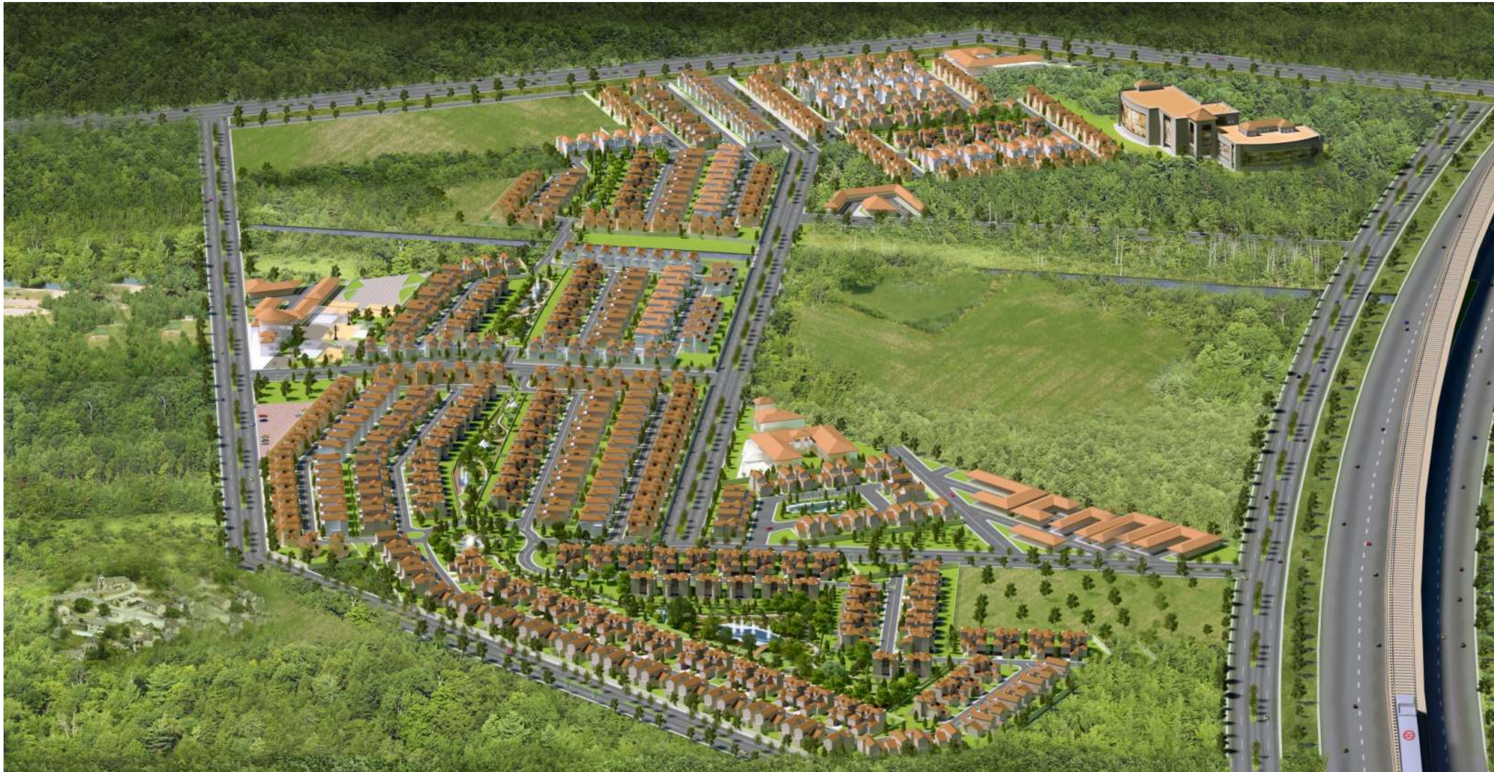
Aerial View of Gurgaon 99