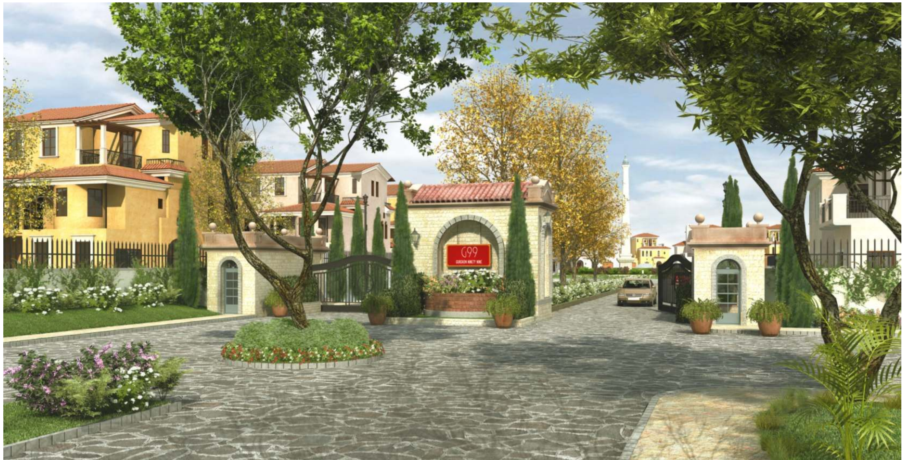
Main Entrance at Gurgaon 99