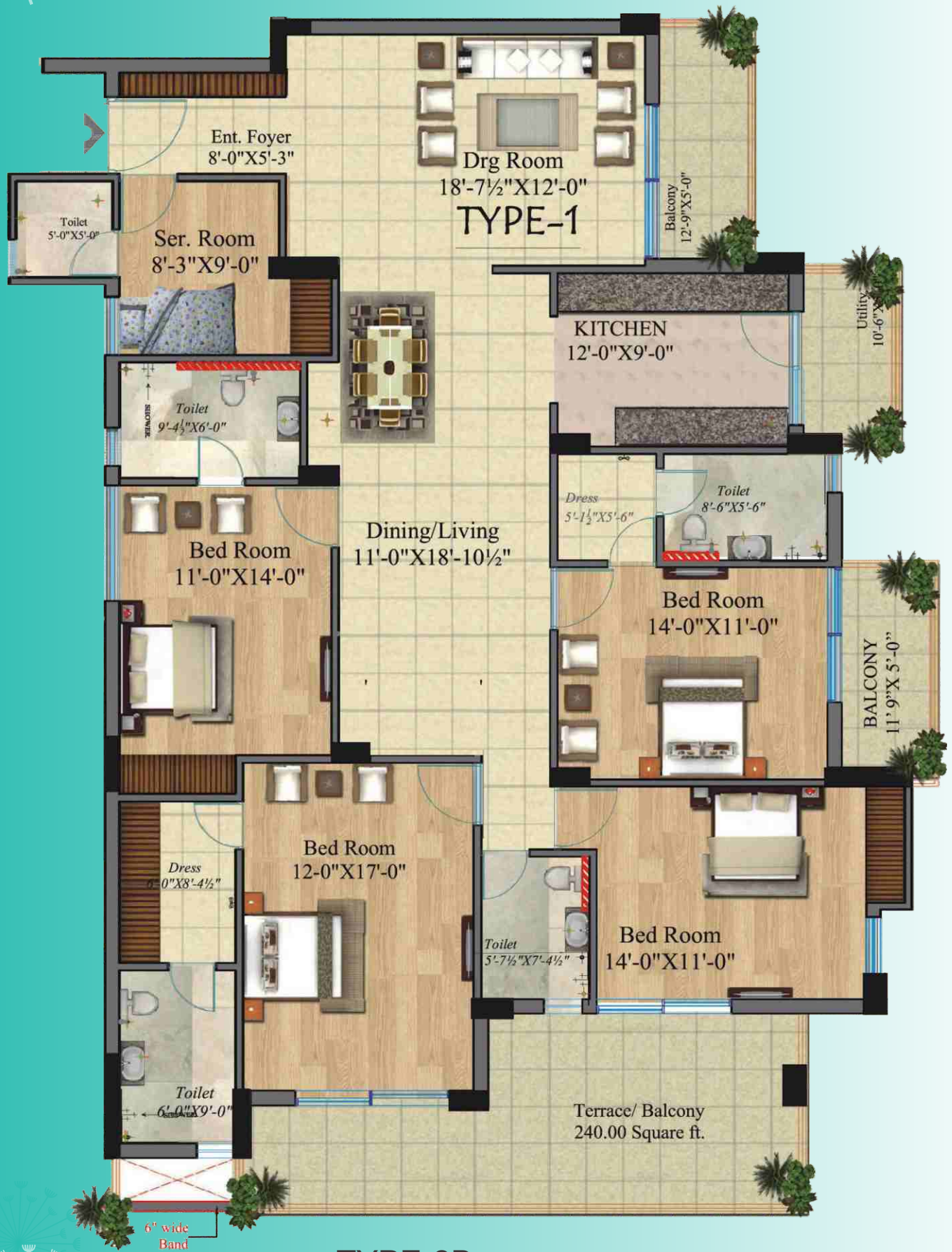
TYPE-2B 4BHK + SERVANT ROOM Super Builtup Area - 2870 Sq. Ft. Carpet Area - 184 Sq. Ft.

4BHK + Servant Room ( Ground to 5th Floor )