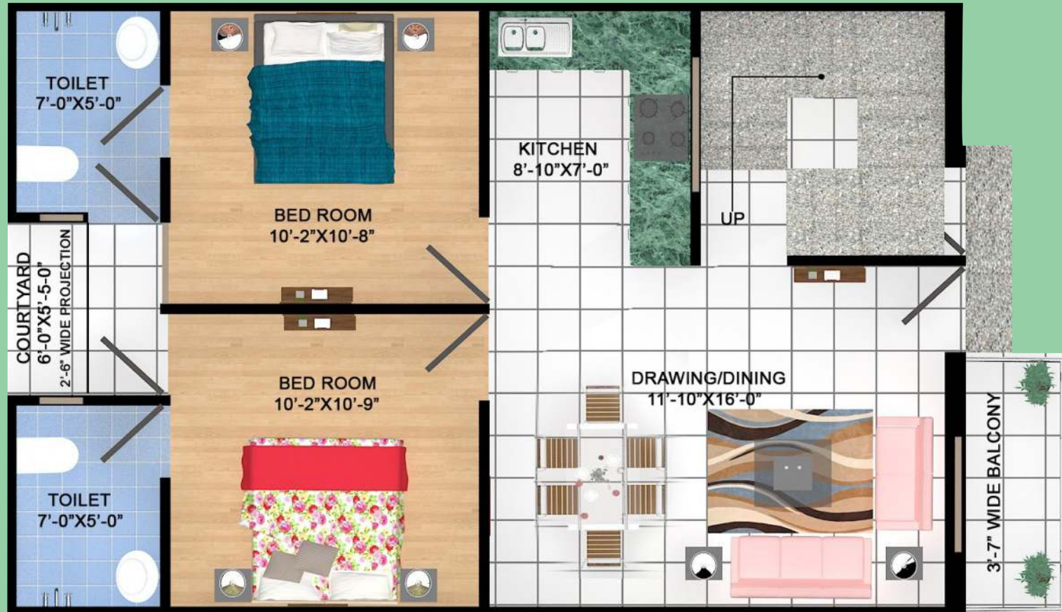
80 Sq. Yd. Expendable Villa