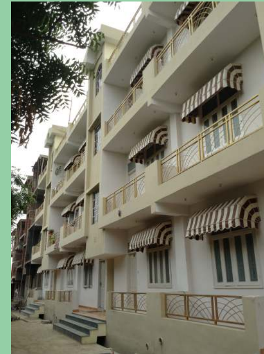
Mehak Residency Project