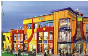
IPEX MALL Patparganj, East Delhi