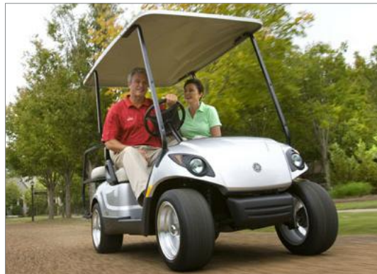
Golf Cart Service