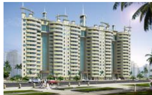
SETHI MAX CITY Vaishali, Ghaziabad