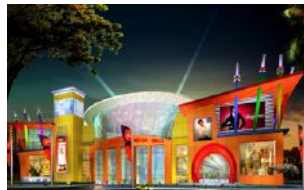
ANGEL MEGA MALL Kaushambi, Ghaziabad