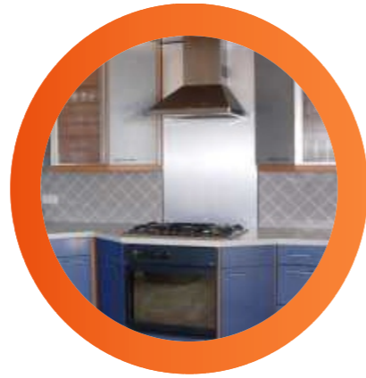
Modular Kitchen below counter in laminated finish with Accessories, Chimney & Hob. Option for different type of Kitchen Counters.