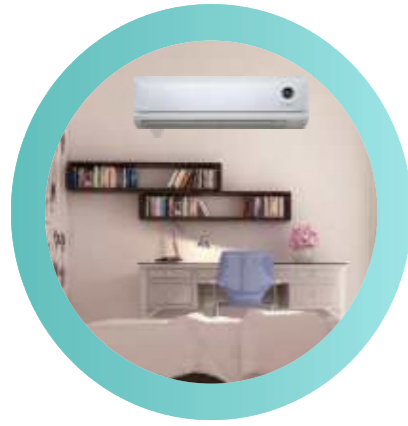
Energy efficient Star Rated Pre-Fitted Air Conditioners in all Bedrooms.