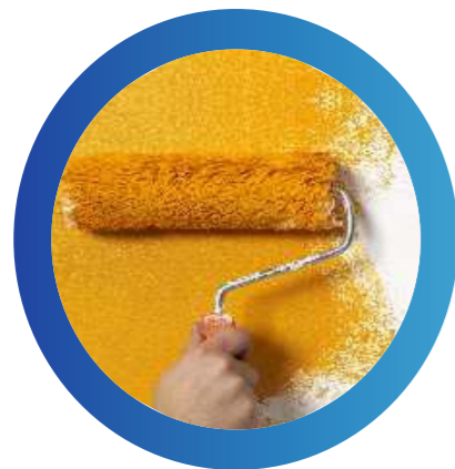
Options to select wall colours of your choice.