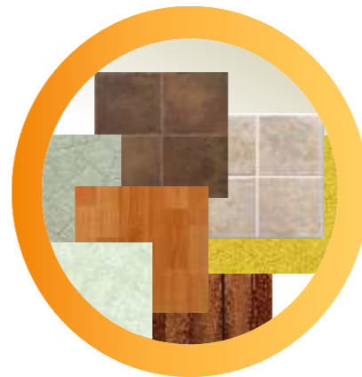
Option to choose vitrified tiles or wooden flooring Also, an option of variety amongst them.