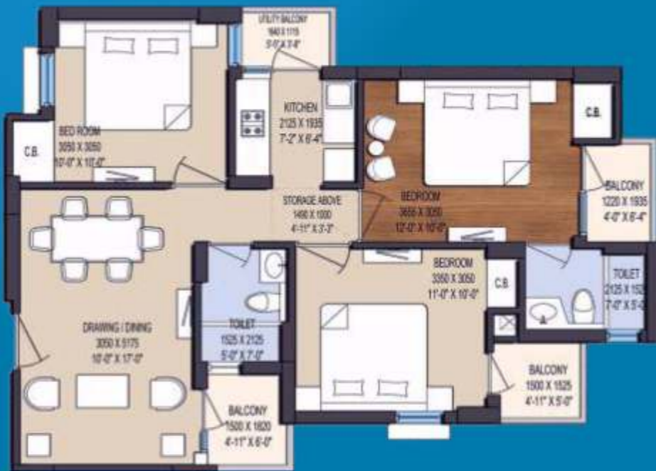
3BHK+3T+UTILITY 1610 sqft

Balconies Area : 96.12 Sq. Ft. Built Up Area : 887.37 Sq. Ft. Carpet Area : 698.79 Sq. Ft. Carpet Area including : 794.91 Sq. Ft. Balconies