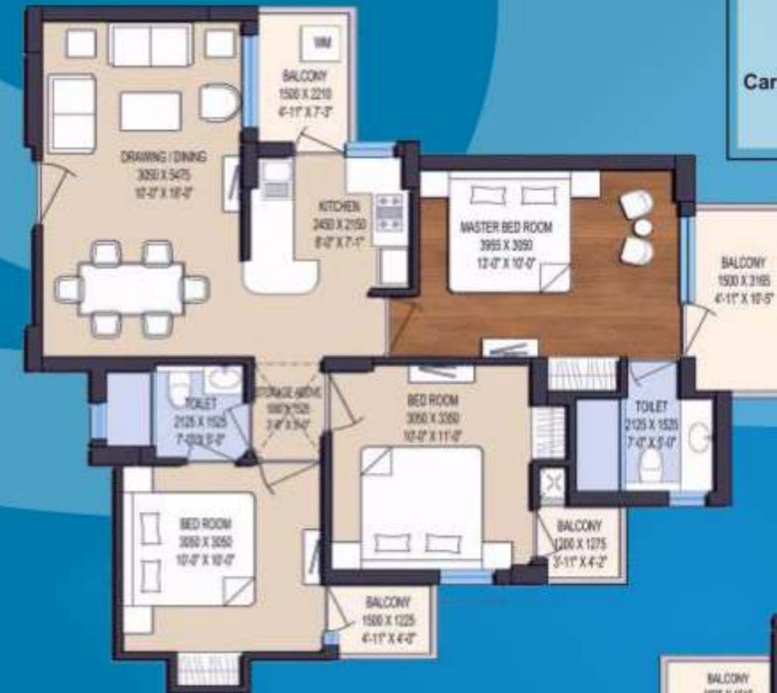
3BHK+2T+UTILITY 1250 sqft

Balconies Area : 86.22 Sq. Ft. Built Up Area : 703.95 Sq. Ft. Carpet Area : 552.62 Sq. Ft. Carpet Area including : 636.84 Sq. Ft. Balconies