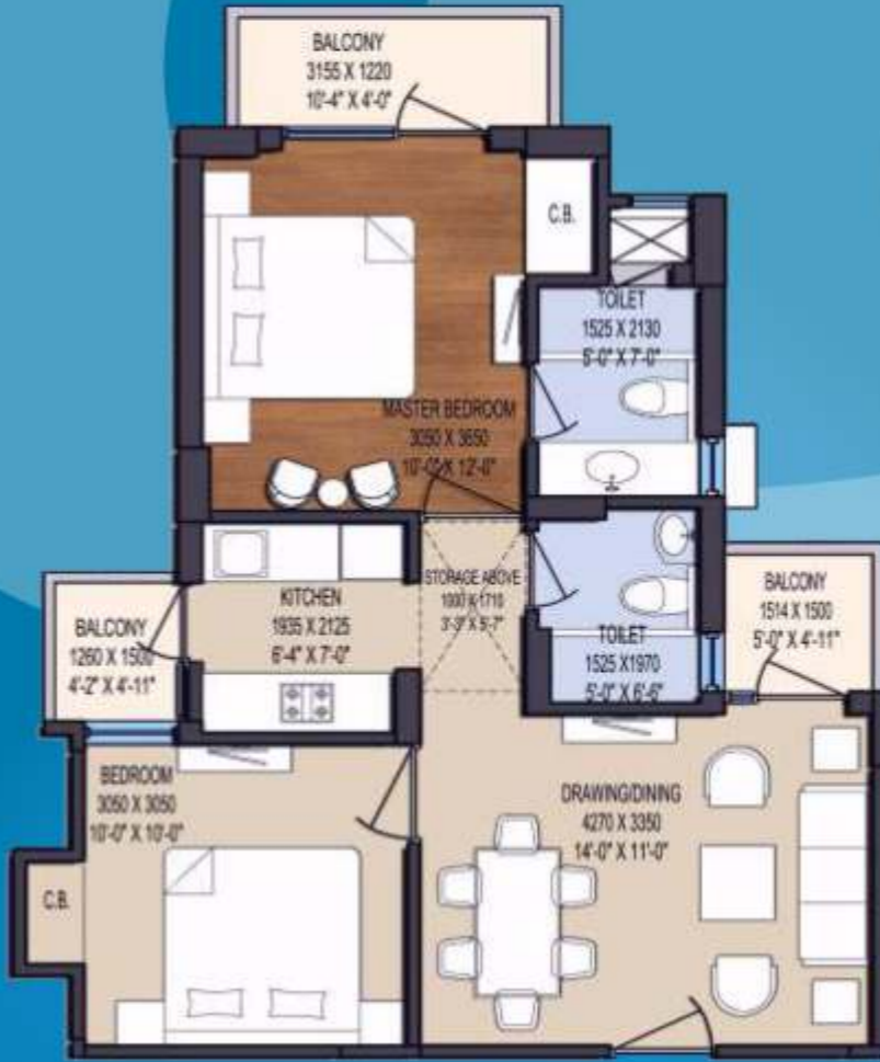
2BHK+ 2T +UTILITY 870 sqft

Balconies Area : 86.22 Sq. Ft. Built Up Area : 703.95 Sq. Ft. Carpet Area : 552.62 Sq. Ft. Carpet Area including : 636.84 Sq. Ft. Balconies