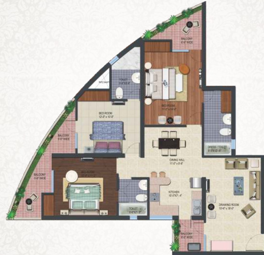
SUPER AREA - 1725 sq. ft. 3 Bedroom + 3 Toilets + Kitchen + Dining + Drawing + Dress + 4 Balcony