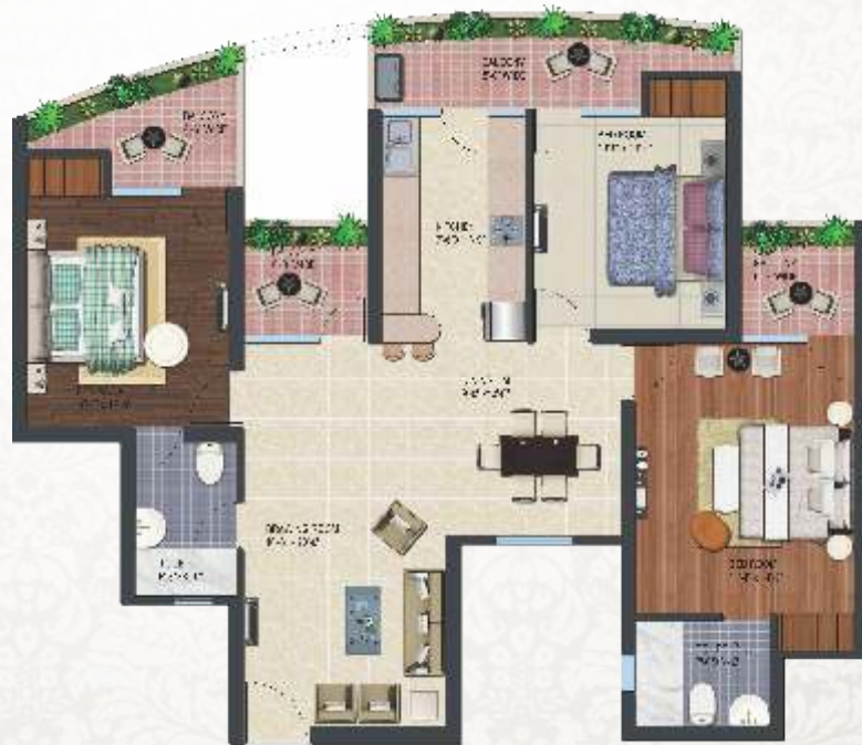
SUPER AREA - 1596 sq. ft. 3 Bedroom + 2 Toilets + Kitchen + Dining + Drawing + 4 Balcony