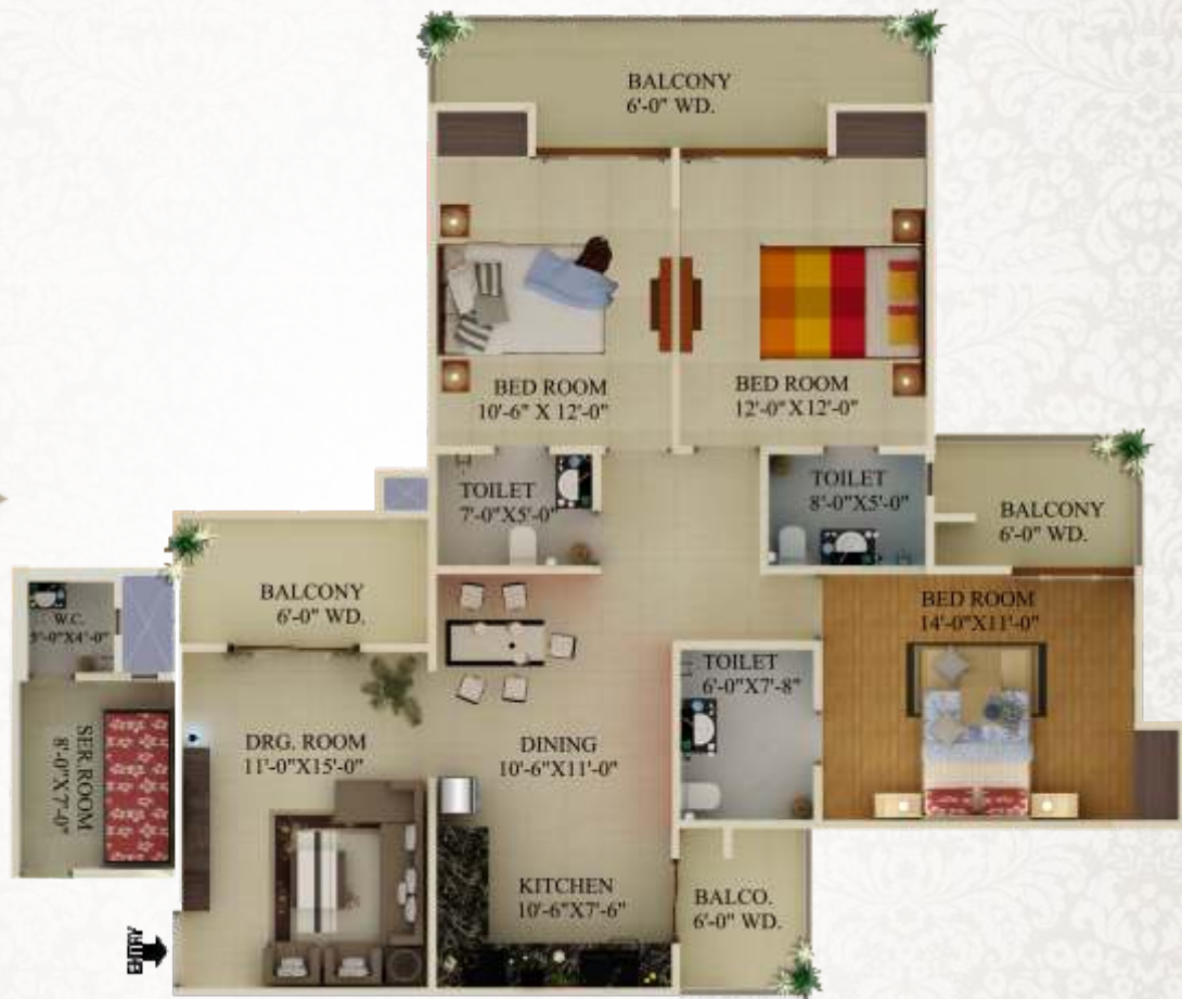
SUPER AREA - 1906 sq. ft.

3 Bedroom + 3 Toilets + Kitchen + Dining + Drawing + 4 Balcony