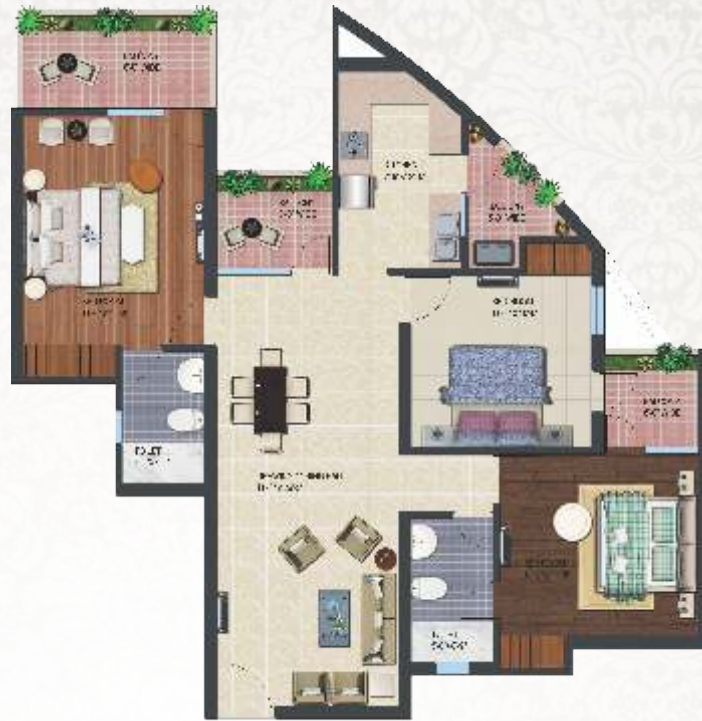
SUPER AREA - 1590 sq. ft. 3 Bedroom + 2 Toilets + Kitchen + Dining + Drawing + 4 Balcony