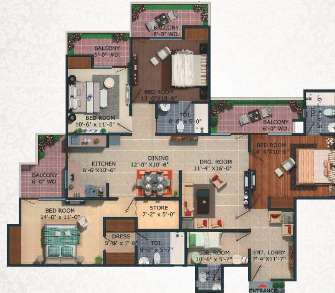
SUPER AREA - 2364 sq. ft.

3 Bedroom + 3 Toilets + Kitchen + Dining + Drawing + 4 Balcony