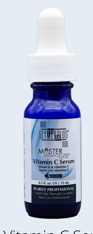
Vitamin C Serum

This solution is packed full of ingredients designed to help firm that pesky skin under the neck.