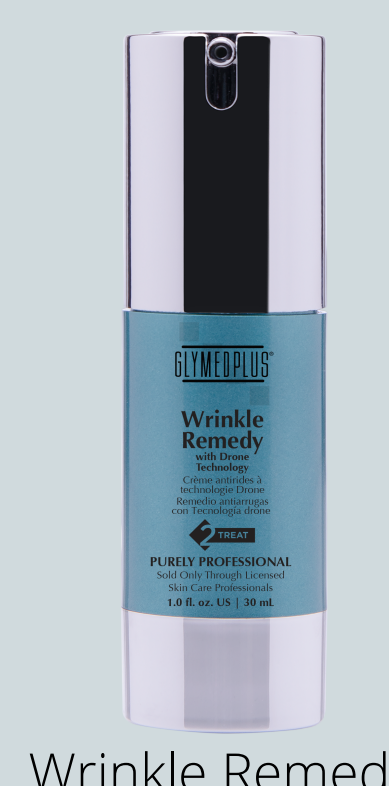
Wrinkle Remedy with Drone Technology

Whoever says miracles don't come true has never seen this cocktail in action. Notice visible changes in as little as 30 days!