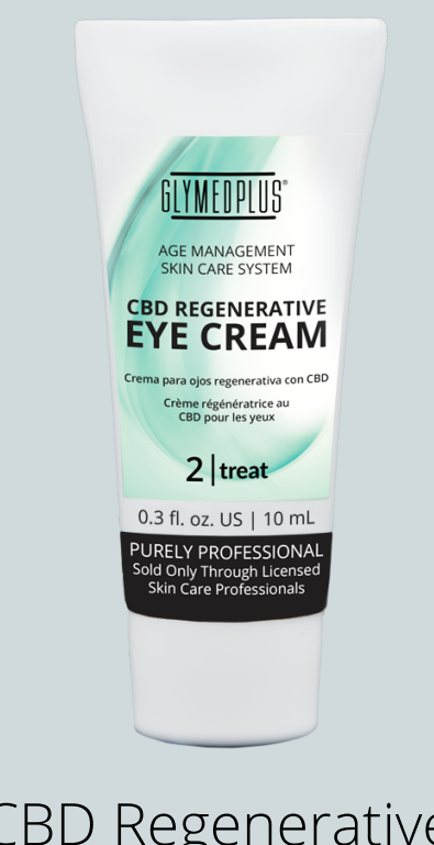
CBD Regenerative Eye Cream