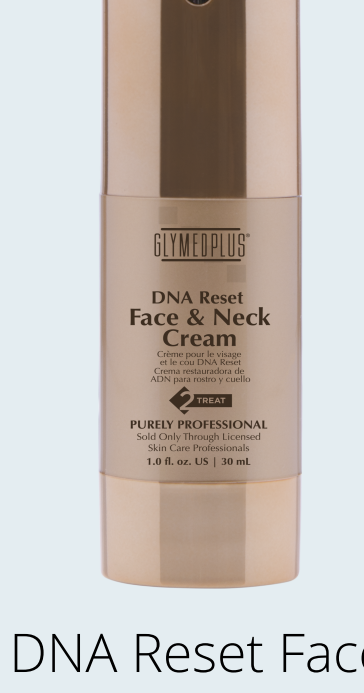
DNA Reset Face & Neck Cream