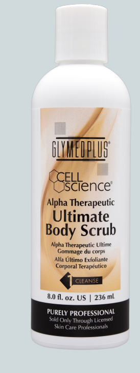
Alpha Therapeutic Ultimate Body Scrub

Improve the appearance of cellulite by exfoliating, detoxifying, and stimulating circulation to rework and rebalance adipose tissue.