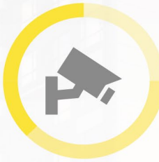
24 hr surveillance