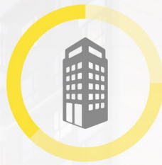
High speed lifts