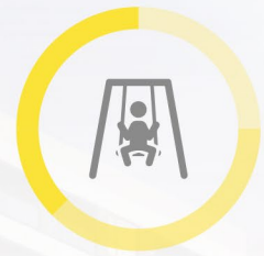
Kids play area