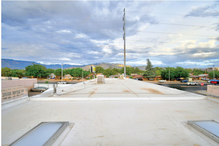
Newer TPO Roof