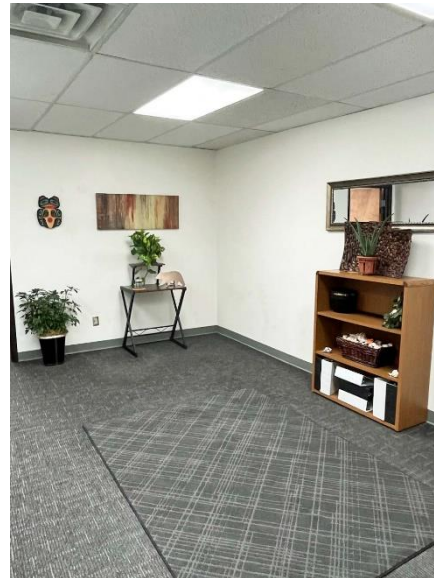
Entry Areas, with prior tenant furniture (now removed, no furniture provided)