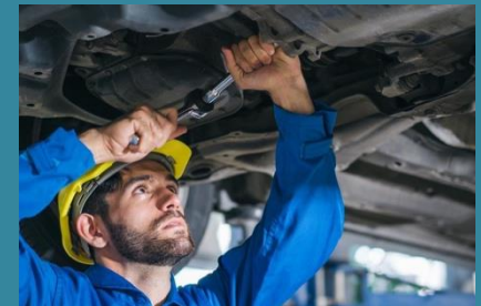
GENERAL OFFICE USE