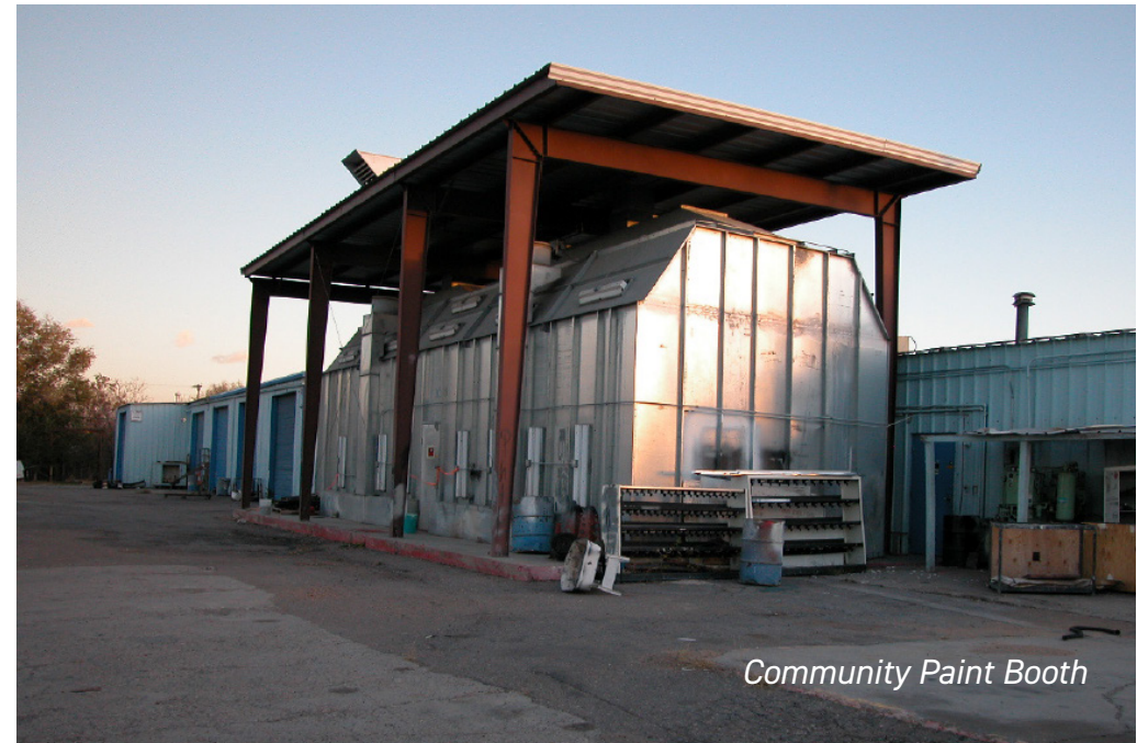
Community Paint Booth

TRUCK FRIENDLY Right turn in, right turn out, left turn in through island cut to accommodate large trucks on 2nd Street from southbound lane, with long separate turn bay in island