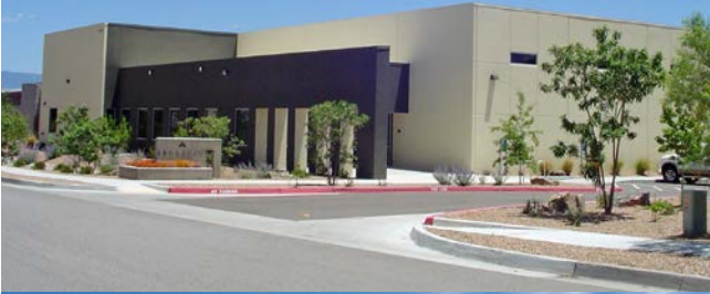
Garden - Office