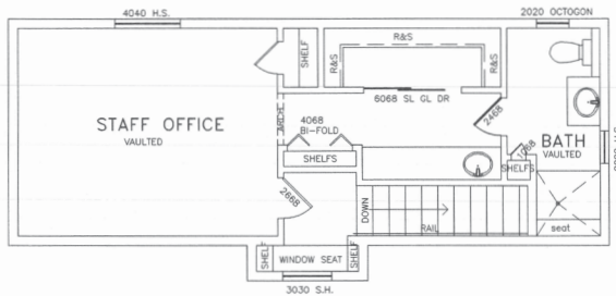
2nd FLOOR PLAN 1/4" = 1'-0"

1st Floor: +/-3,085 SF 2nd Floor: +/-486 SF Total: +/-3,571 SF