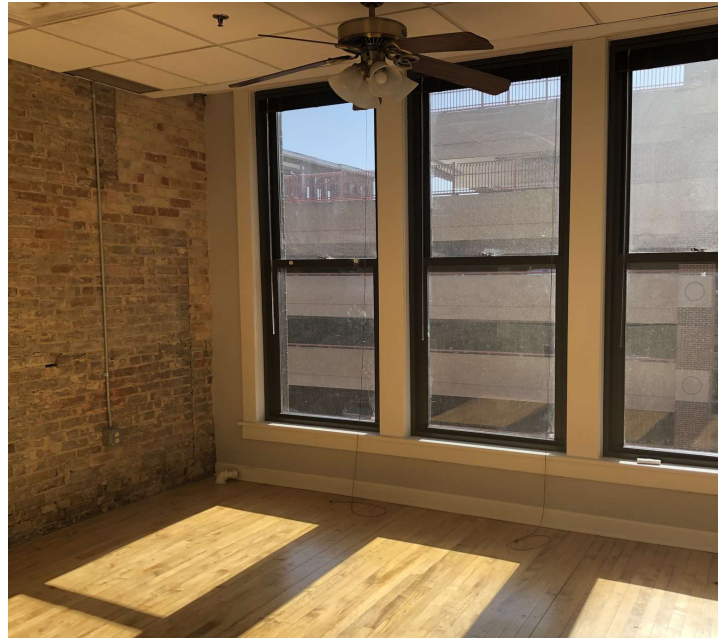
414 - Leased