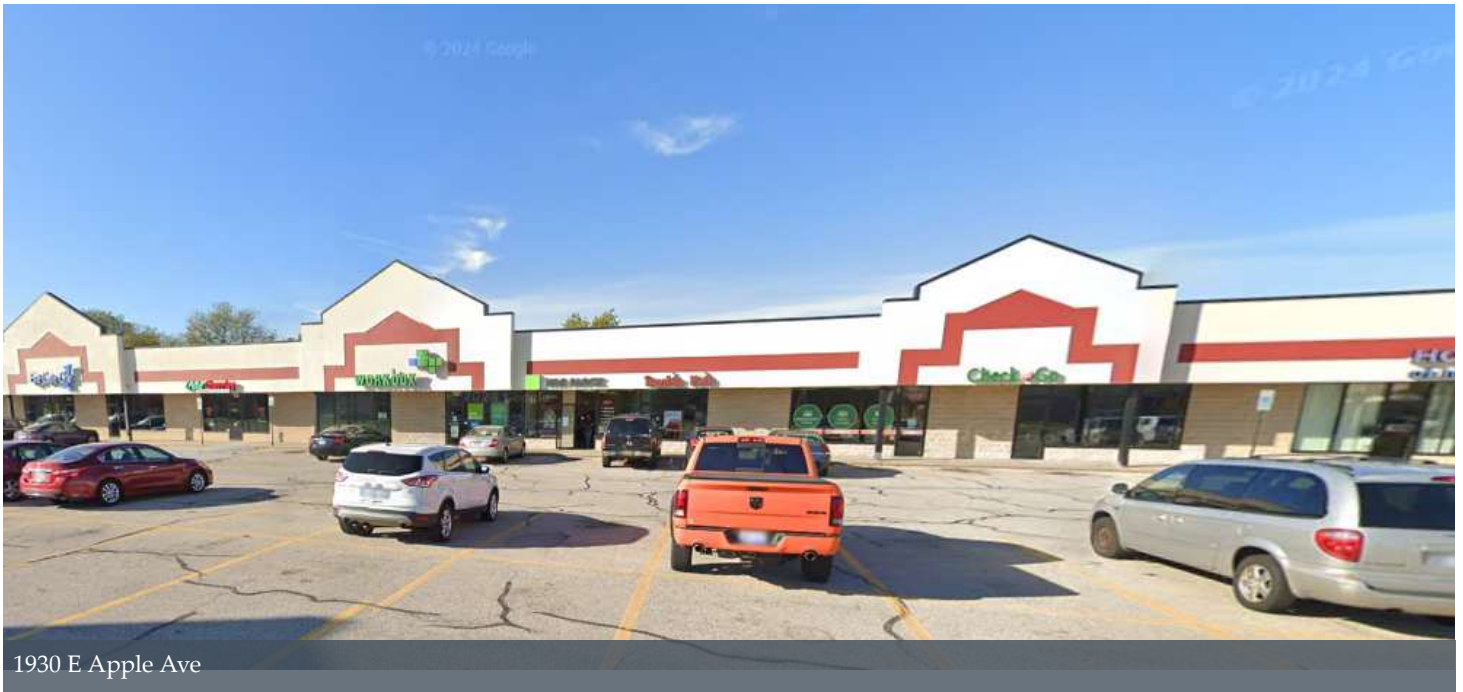
1930 E Apple Ave