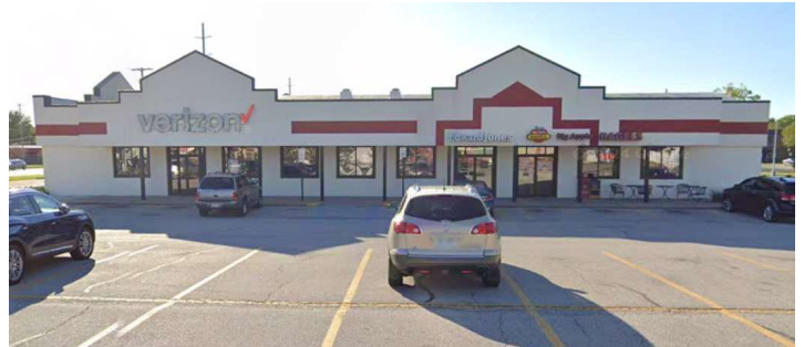
1970 E Apple Ave