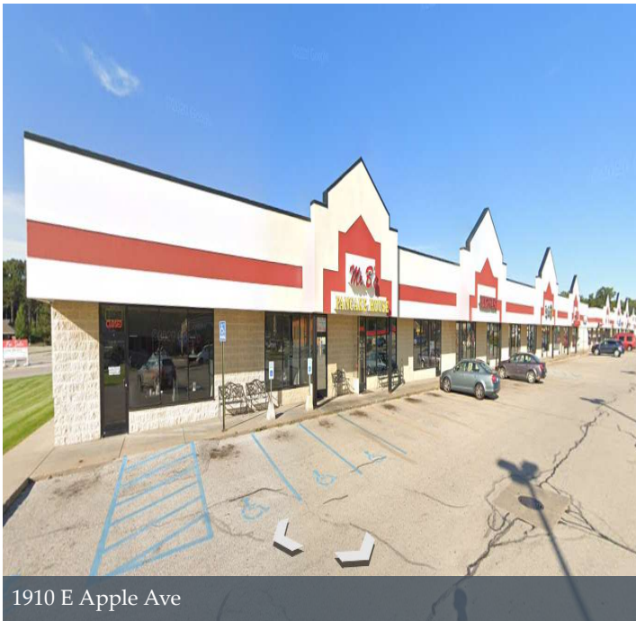
1910 E Apple Ave