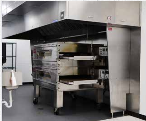
HOOD AND VENTILATION SYSTEM