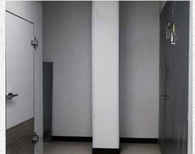
WALK-IN COOLER AND FREEZER