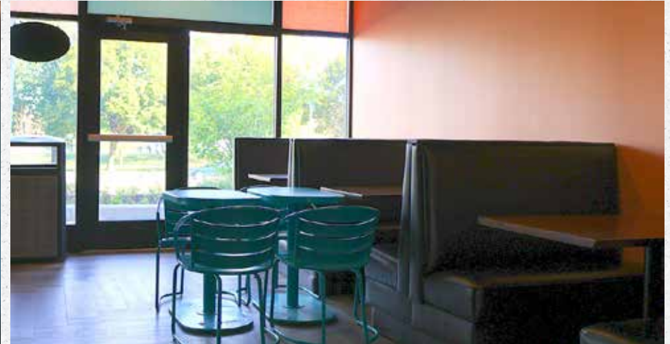
INDOOR BOOTH AND OUTDOOR SEATING AVAILABLE