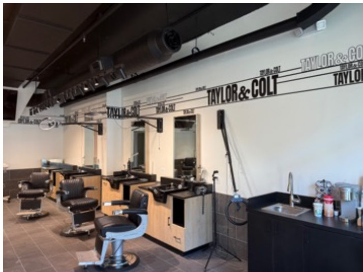
Interior Right View