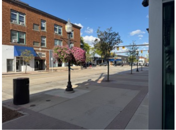
Exterior Right View