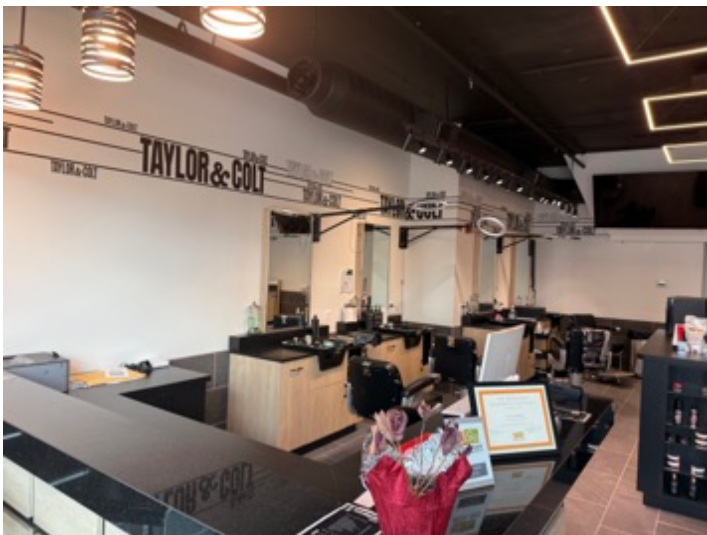
Interior Left View