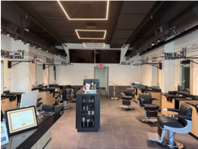
Front View of Service Area