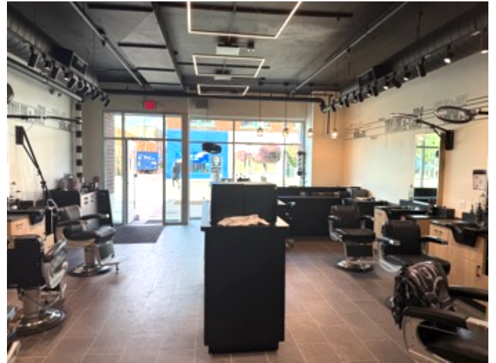
View from back of Service Area