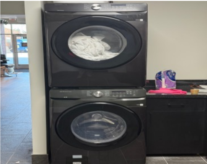
Washer & Dryer