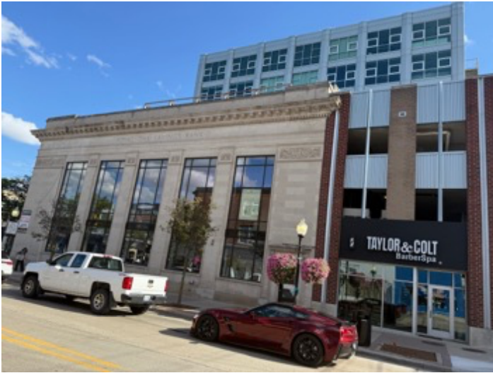
Exterior Left View